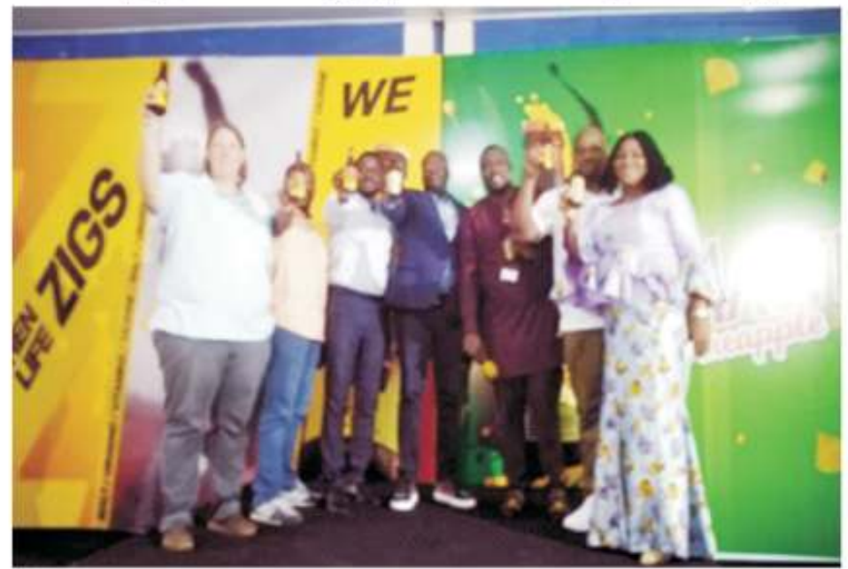
The management of SLBL at the launch

familiar wholesome goodness of Maltina with a burst of refreshing pineapple flavor.