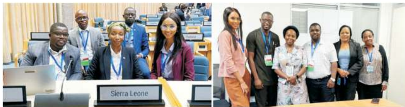
Sierra Leone Delegation

Exploring various preferences to eliminate and phase out chemicals and polymers of concern and phase