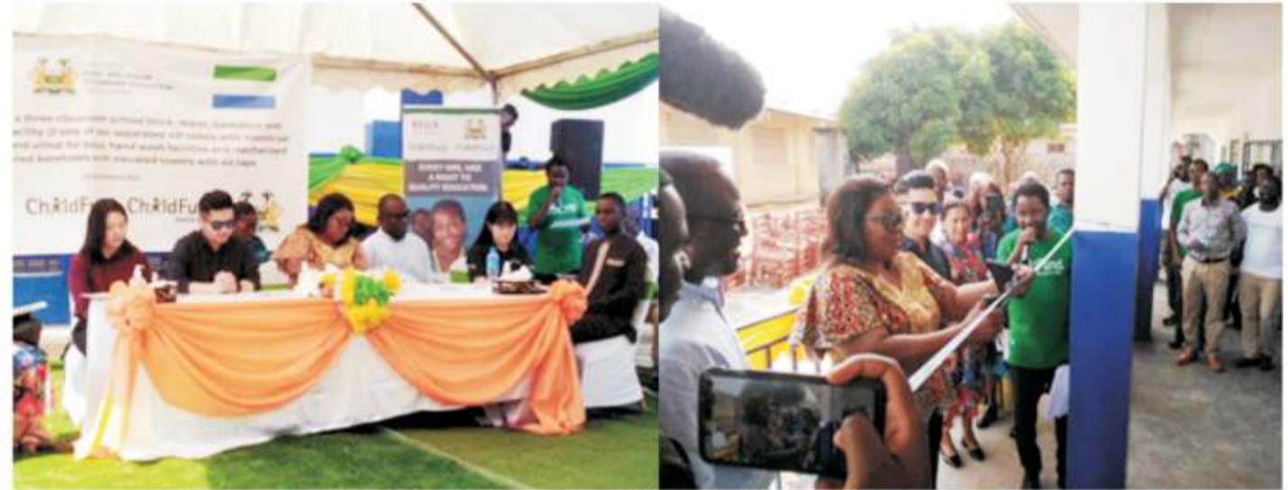
The official handing over ceremony, the Deputy Minister of (MBSSE), Mamusu Massaquoi cutting the ribbon