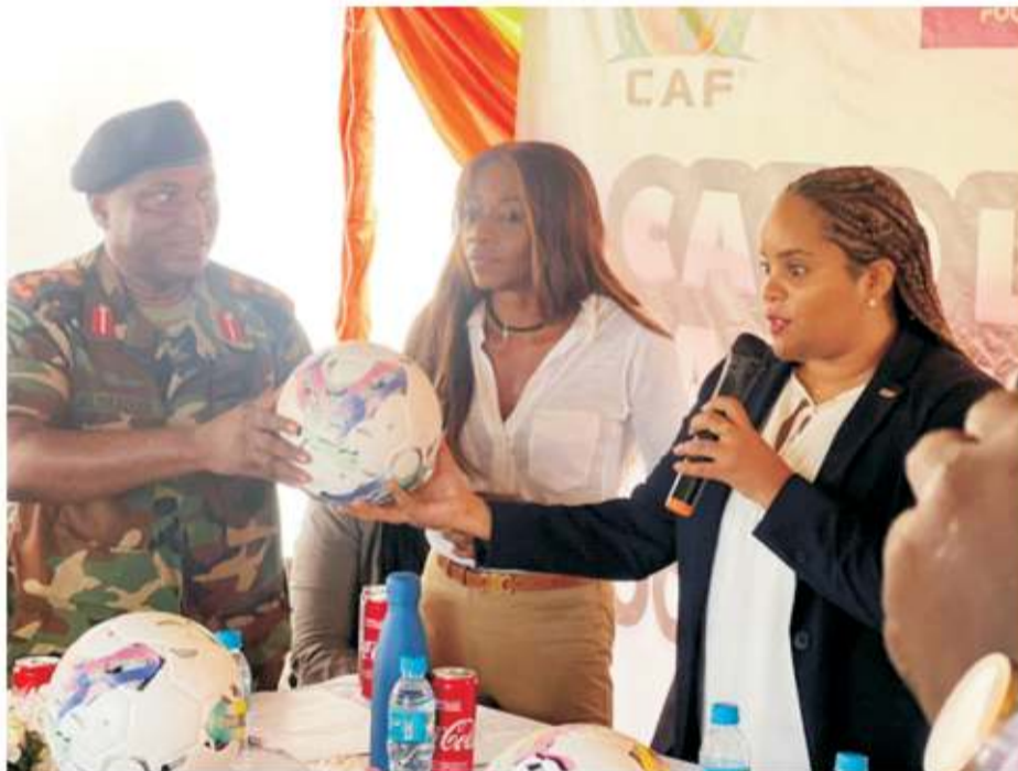
CAF Head of Female Football handing over the ball to the Acting DG of the SLCS