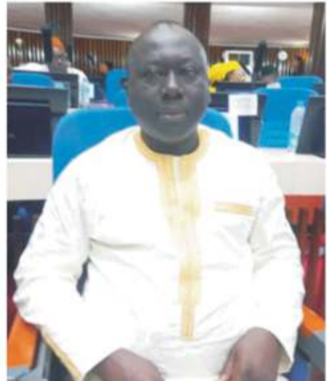
Hon. Sallieu O. Sesay says the 2024 budget is a scam

By Jariatu S. Bangura The main opposition All People's Congress (APC) Member of Parliament from Bombali, Hon. Sallieu O. Sesay, has expressed pessimism that the 2024 budget presented by the Minister of Finance has a lot promises that may not be fulfilled in the midst of economic hard-hit. Whilst contributing to the debate on the 2024 budget discussion, Hon. Sesay noted that mechanisms should be put in place to mobilise more revenue rather than putting more burden on the already suffering masses