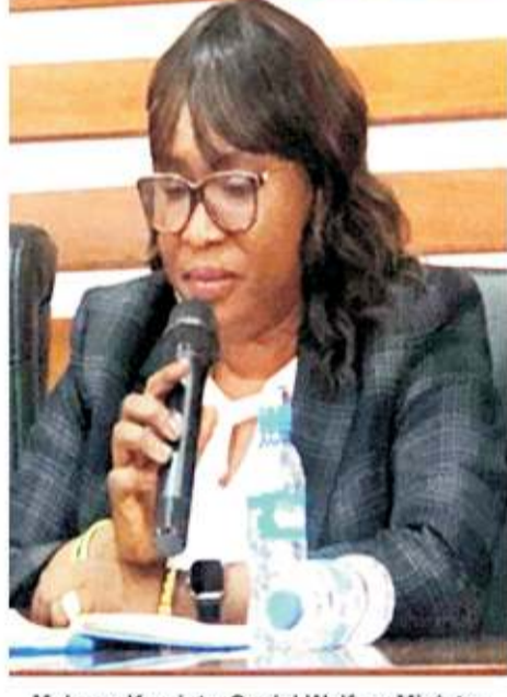
Melrose Kaminty, Social Welfare Minister

By Yusufu S. Bangura Minister of Social Welfare, Melrose Kaminty, during the commemoration of the November 18 United Nations World Day on sexual and gender based violence, asserted that violence against women is violence against the state. She stated that the United Nations World Day is a very remarkable and an important milestone in the history of the world, because Sierra Leone has joined other nations across the globe to commemorate the day with a goal of raising public awareness about the plights of survivors of sexual and gender based violence.