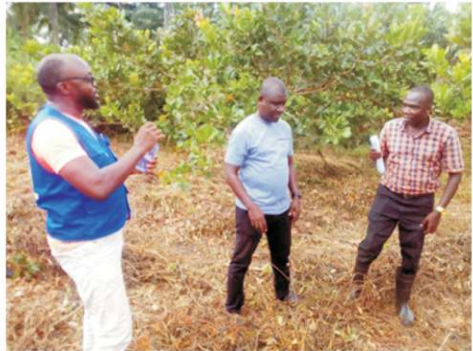
EU representative L, Solidaridad M & SALRI representative M

He said he was there to monitor and see how the grant allocated to the project has been used for its intended