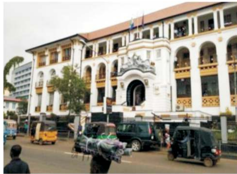
Siaka Steven Street High Court building