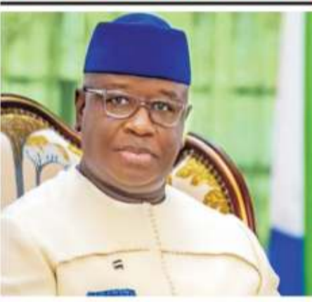
President Julius Maada Bio

As members disassociate themselves from vote of no-confidence... SLANGO's Board remains intact