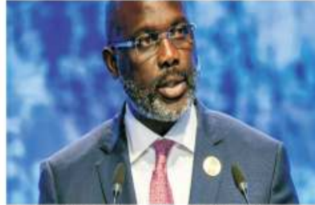
Liberia's President George Weah delivers a speech at the leaders summit of the COP27 in Egypt's Red Sea resort city of the same name, on November 8, 2022.

"Liberian people have spoken" Weah said he had spoken to Boakai "to congratulate