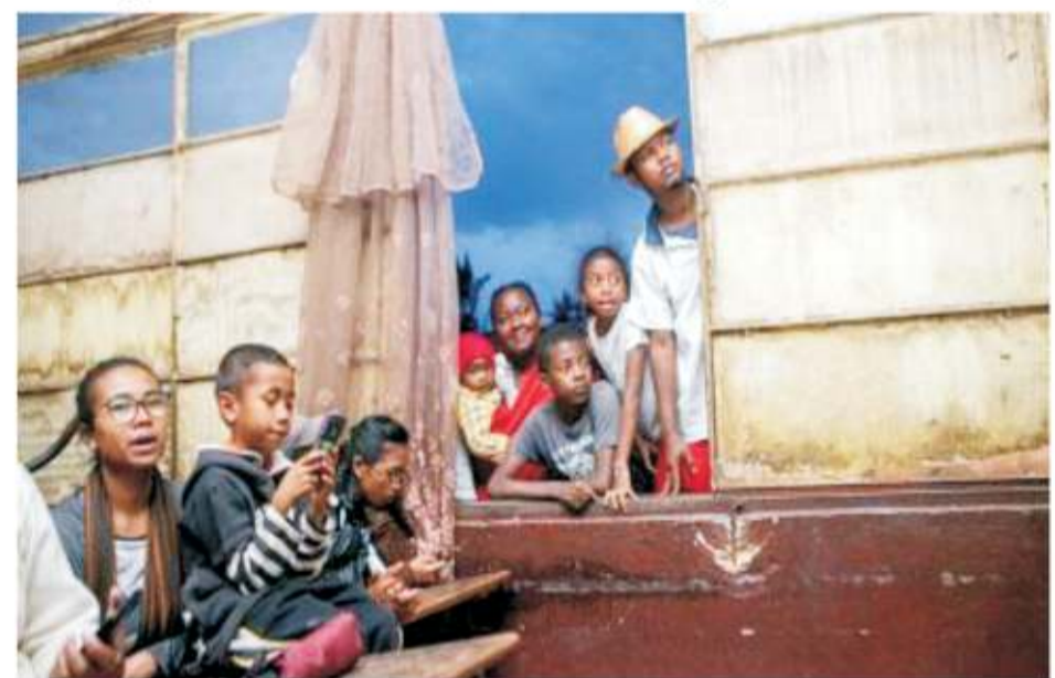
Bystanders look on as electoral officials (unseen) count votes at a polling station in Antananarivo. 16/11/2023

To normality on Friday, a day after the country's presidential elections. As the country awaits the expected announcement of Rajoelina's victory, people are getting on with daily life. **