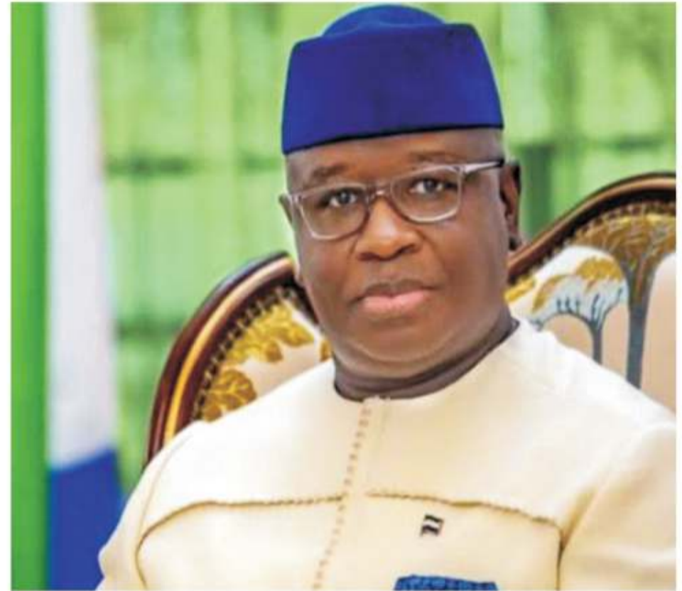
President Julius Maada Bio

"Today, I must say with pride that our girls have surpassed their peers in