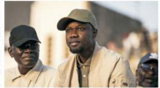
Opposition leader Ousmane Sonko (C) looks on during an opposition meeting two days before his trial, in Dakar on March 14, 2023

Sonko, 49, was on June 1 convicted in abstentia