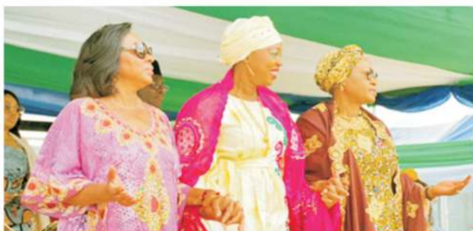
First Ladies of Sierra Leone, Nigeria & Angola taking pictures during the event

President Bio: 94% of sexual exploitation victims are women & girls