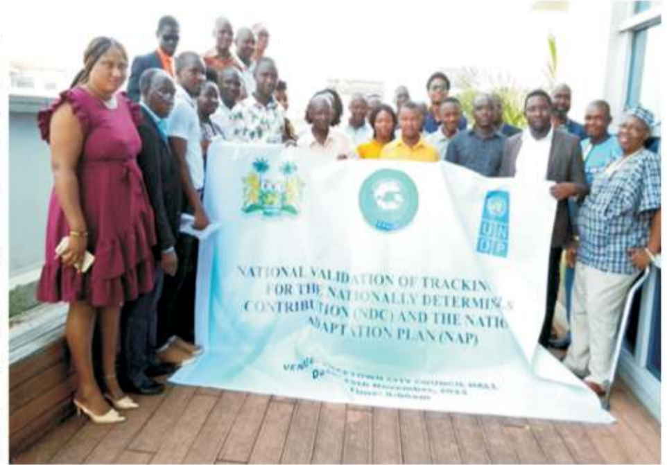
EPA staffs & representatives from different MDAs validate the document

He went on to say the NAP was developed in the same year around 2015 to 2017 and it was called the National Adaptation Plan of Action. "The National Adaptation Plan was developed because Sierra Leone is a low emitter of greenhouse gases into the atmosphere, and the low contributor to global warming and climate change because of its status and level of emission of greenhouse gases into the atmosphere. But, however, Sierra Leone is one of the countries that are suffering disproportionately from the adverse effects of climate change. In effect, though we have not met emitters of greenhouse gases, yet we have most of the consequences and that is why Sierra Leone was listed as one of the