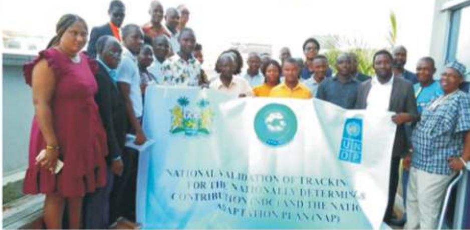
EPA staffs & representatives from different MDAs validate the document