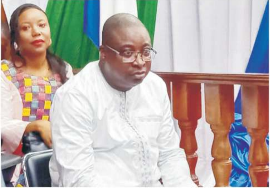
Governor Ibrahim Stevens

By Ishmael Dumbuya The 2024 Finance Act has raised concerns among citizens due to the proposed increase in taxes on essential commodities such as rice, cooking gas, cement, and iron rods. The increment in the price of cooking gas might encourage citizens to resort to the use of firewood and charcoal, which is a significant concern as more than half of the population struggle to use gas for cooking. Cont. Page 3