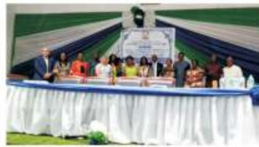
Social Welfare Minister & partners pose for photo

"It is our hope that after completion, the plan will be launched and disseminated in a roundtable conference with our key stakeholders, including our donors, and development partners. We are particularly driven towards the development of this strategic plan, as it helps to establish the sense of direction in achieving our goal, successfully and enhancing our collaborative efforts as we agree on actions that will contribute in delivering a broader vision," she stated.