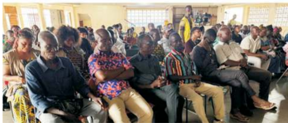
Members at the meeting

Members of the Sierra Leone Association of Non-Governmental Organization (SLANGO) have elected an interim 9-member body to run the affairs of the association until a substantive board is elected at an AGM.