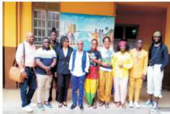
Deputy Minister of Tourism & delegates from Jamaica posed for picture

"Telem Uncommon Sounds is a registered National Non-Governmental Organisation dedicated to promoting and preserving the rich musical heritage of Sierra Leone. Telem 2023 is a significant opportunity for our talented musicians to enhance their skills, exchange cultural knowledge, and establish valuable