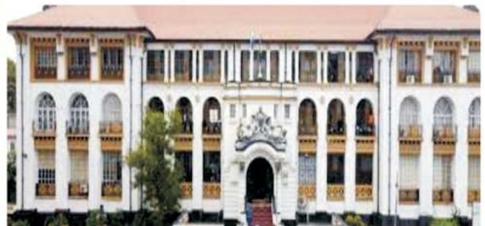
High Court Building