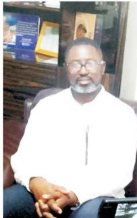
IGR Boss speaking to the media

is meant to add to that debate. We started-off by chronicling what is the state of most state enterprises and parastatals such as NASSIT, EDSA, among others and we realise that most of these parastatals are not performing," he said.