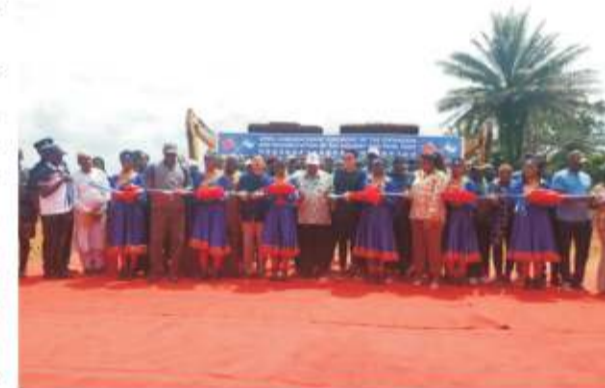
Government officials and Leone Rock executives cutting the tape to the project

the jetty with an investment of $4 million USD. In total, we are looking at an investment of $40-50 million USD, and we are committed to completing these projects within six months from today's commissioning.