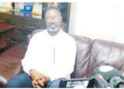
IGR Boss speaking to the media

IGR calls: State owned enterprises be positioned for profit making