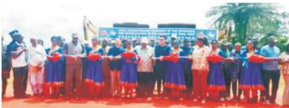
Government officials and Leone Rock executives cutting the tape to the project