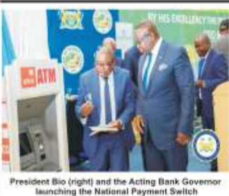
President Bio (right) and the Acting Bank Governor launching the National Payment Switch