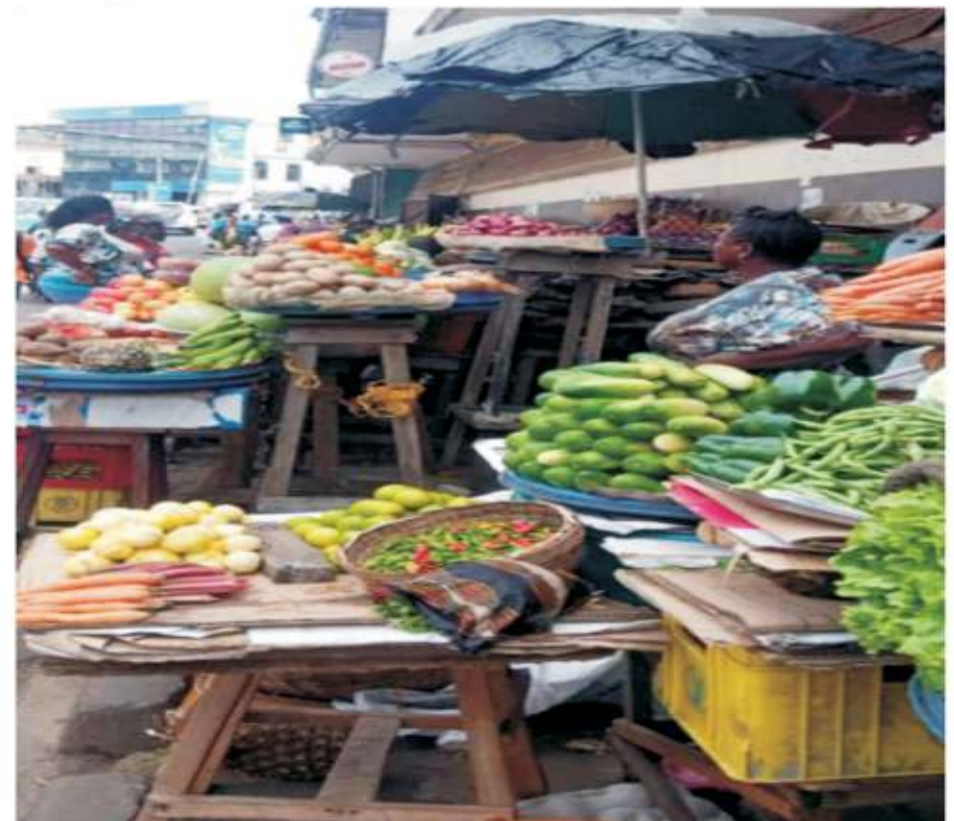
Kroo Town Road Market, Freetown