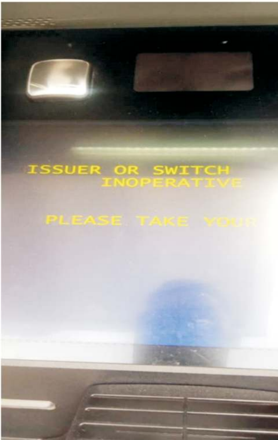
An ATM of one of the five banks believed to be operating the National Payment Switch. An attempt to withdraw cash using two separate ATM cards of the switch went unsuccessful.

Other perennial challenges – lack of awareness, low digital skill gap, limited network connectivity are all allied factors brazing to undermine the effectiveness of the payment switch.