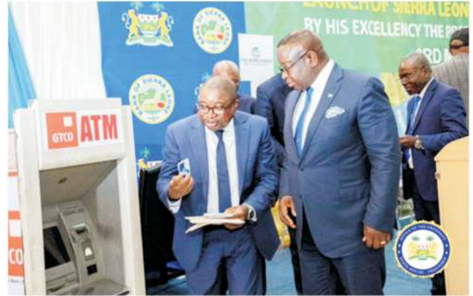
President Bio (right) and the Acting Bank Governor launching the National Payment Switch

President Bio referred to the launching of the switch as "the start of new era in our internal banking and financial services sector." the new infrastructure will cover processing of card transactions carried out through point-of-sale and Automated Teller Machines managed by different financial institutions. And "...yet another bold step forward towards actualizing my SLPP Government's "New Direction" Manifesto."