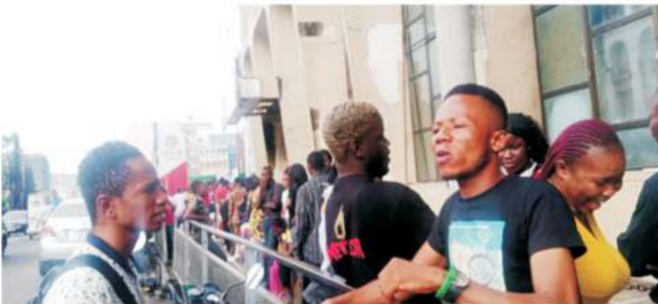
Customers waiting in front of Sierra Leone Commercial Bank

This report was produced under the DPI Africa Journalism Fellowship Programme, organized by the Media Foundation for West Africa with support from Co-Develop.