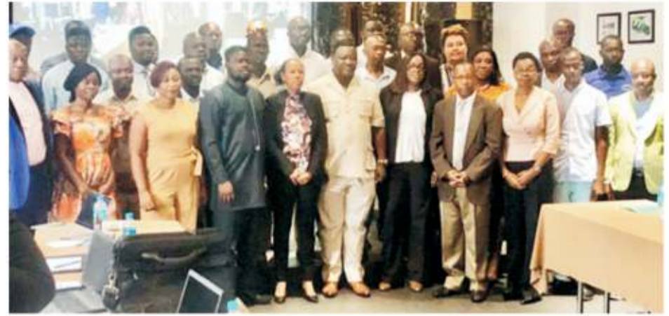
Cross-section of participants at the RASME training, Atlantic Lumley Hotel in Freetown

Hashi pointed out that the three-day training will horn around capacity building project terms, which will be accompanied by a communication strategy and conduct