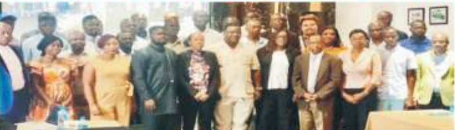
Cross-section of participants at the RASME training, Atlantic Lumley Hotel in Freetown