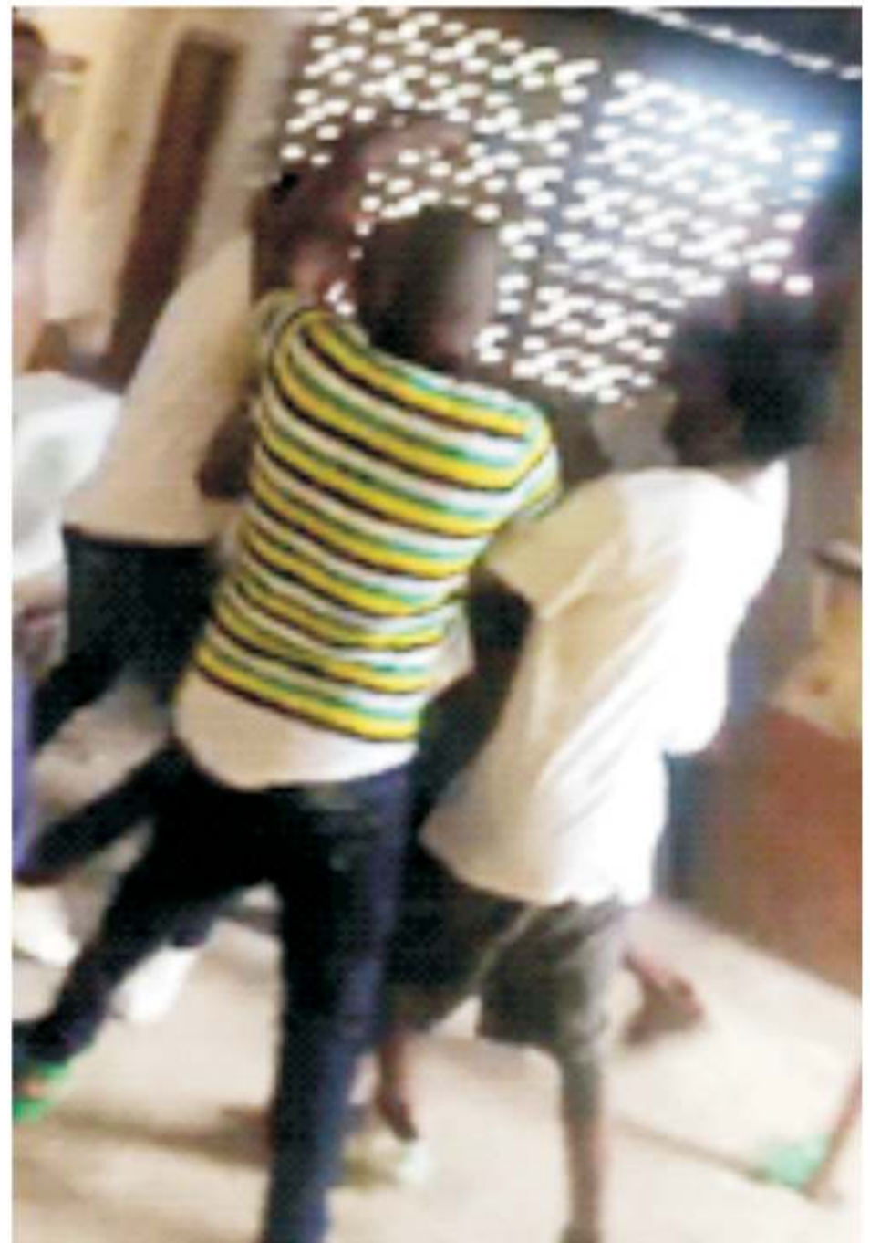
Vandals making their way into the radio station

He assured that the matter is under police investigations and that they have provided the police with audio visual evidence of what transpired at the radio station so that the matter will charged to court.