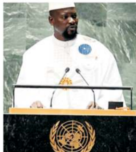
Guinea's President Mamady Doumbouya addresses the 78th United Nations General Assembly at UN headquarters in New York City on September 21, 2023.

"We Africans are insulted by the boxes, the categories which sometimes place us under the