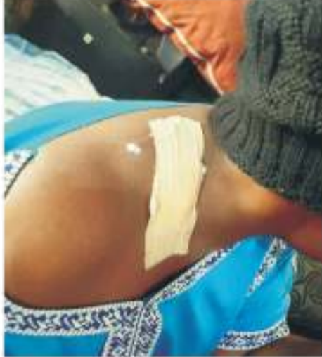
Fatmata Douda narrates how she suffered bullet wound