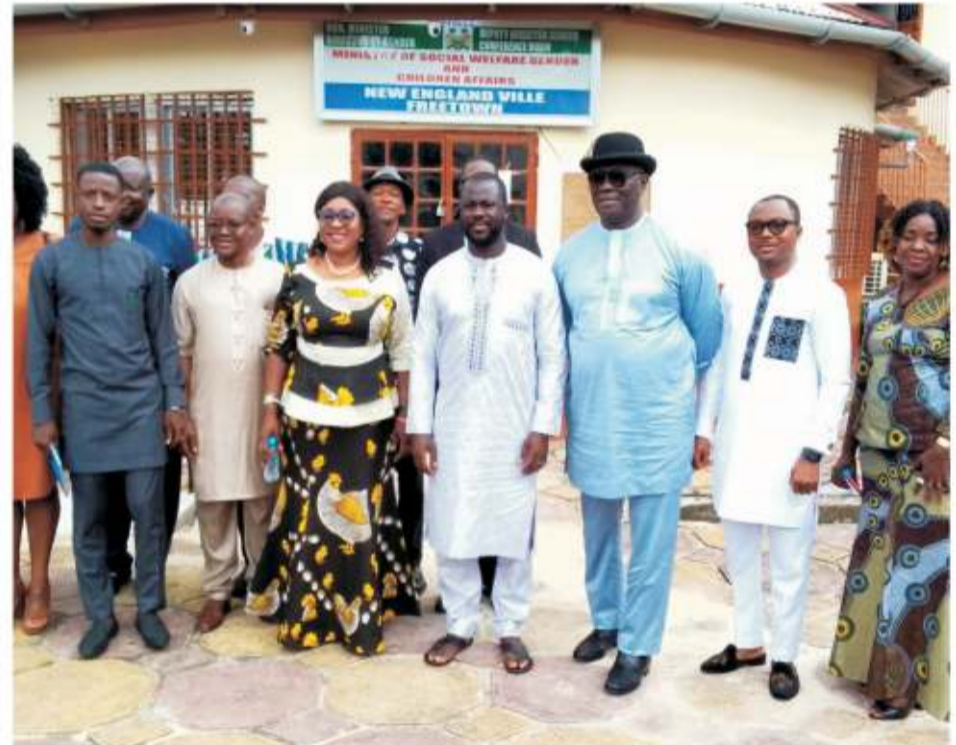
Ministers and Deputy Ministers from various ministries pose for photos after the launching ceremony