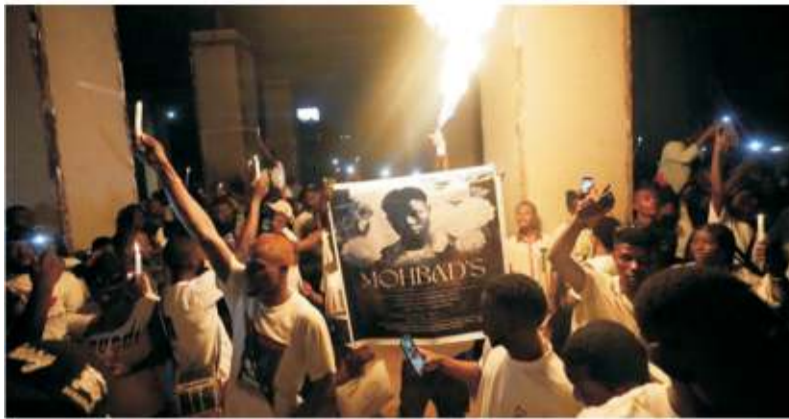
People hold candle lights and a flare during a minute of silence at a protest inside a park in Lagos, Thursday, Sept. 21, 2023, to demand justice for Afrobeats star Mohbad.

Hundreds of Nigerians rallied in Lagos Thursday to demand an investigation into last week's death of an upcoming singer, whose sudden demise has fired up the country's Afrobeats world.