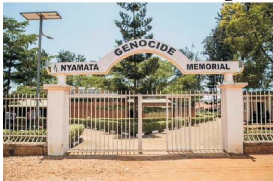
UNESCO puts Rwanda genocide memorials on World Heritage list - Copyright © africanews JACQUES NKINZINGABO/AFP or licensors

Four memorials to the 1994 genocide in Rwanda of more than 800,000 people, mainly Tutsi, were added to UNESCO's World Heritage list on Wednesday, the UN cultural body said. The sites at Nyamata, Murambi, Gisozi and Bisesero commemorating the mass killings were "just inscribed on the UNESCO World Heritage list", the organisation posted on X (formerly Twitter). The four sites commemorate the genocide that