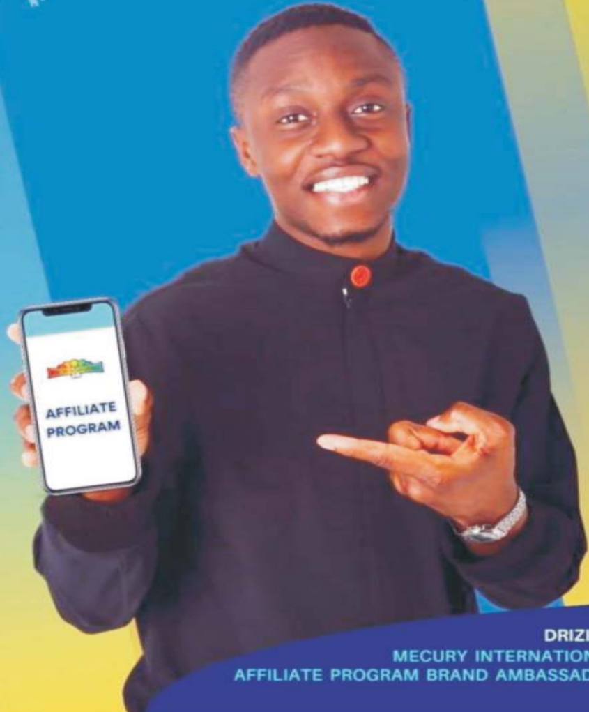
DRIZILIK MERCURY INTERNATIONAL AFFILIATE PROGRAM BRAND AMBASSADOR