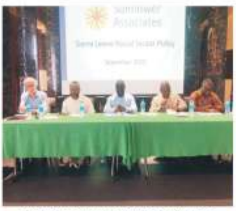
Stakeholders sitting at the high table