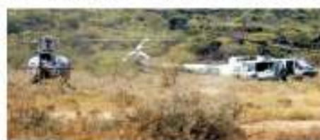
Helicopters of the Kenya Defense Forces land at Ole-Tepesi to recover the bodies

Kenyan troops are also present in Somalia as part of the African Union Transitional Mission in Somalia to help fight Al-Shabab. Kenyan forces deployed to Somalia in 2011, but there are now plans to withdraw