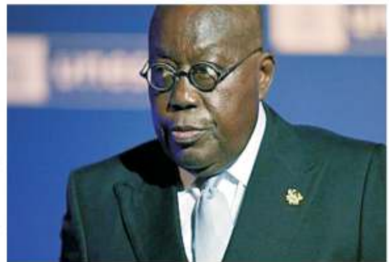
Ghana's President Nana Akufo-Addo arrives to give his speech during celebrations

As of July 31, 2023, Kenya and the Democratic Republic of the Congo held the second and third-largest outstanding loans to the Fund positions in