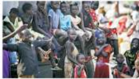
Displaced children gather on top of a truck from which the displaced were filling up

UNICEF, the U.N. children's agency, expressed grave concern for the "many thousands of newborns" among the 333,000 infants expected to be born before the year's close. These infants, along with their mothers, are in dire need of skilled delivery care. However, in a nation where millions find themselves trapped in war-torn regions or displaced, and where critical medical supplies are in scarce supply, such crucial care is rapidly slipping beyond reach. James Elder, spokesperson for UNICEF, delivered this