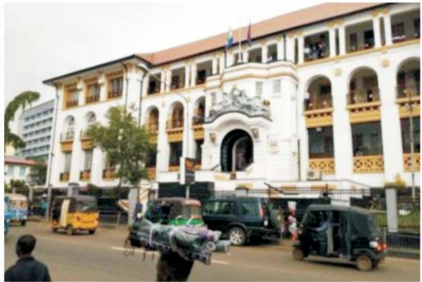
Siaka Steven Street High Court building