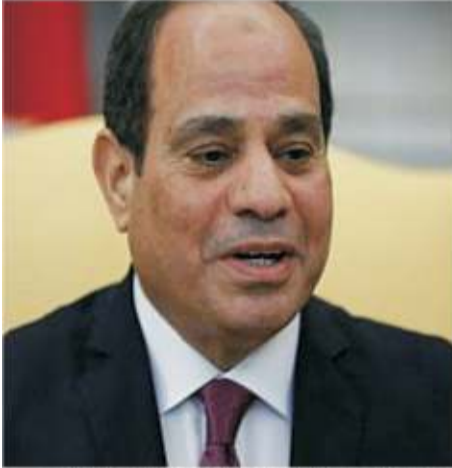
Egyptian President Abdel Fattah el-Sisi is shown while meeting President Donald Trump...

The United States has approved most of its military aid to Egypt despite persistent concerns about human rights, the State Department said on Thursday, underlining Cairo's "crucial" role in the region. The $1.215 billion package marks the third consecutive year that President Joe Biden's administration has waived certain congressional restrictions on aid to Egypt, despite Mr Biden's pledges to put human rights at the heart of US foreign policy. "This decision reflects Egypt's unique contribution to U.S. national security priorities," a State Department