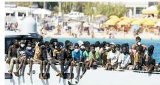
Migrants on the deck of an Italian coastguard vessel as they are taken

Regular arrivals of migrants in Italy via the Mediterranean from North Africa amounted to almost 114,300 between January and August, almost twice as many as in the same period in 2022, according to figures announced Thursday by Frontex.