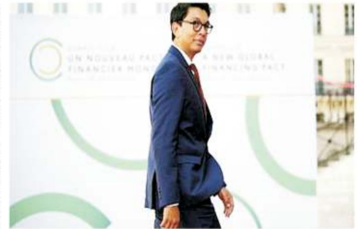
Andry Rajoelina, President of Madagascar, arrives at the closing session of the...

At the end of June, information leaked to the press revealed that the president was naturalized French on the sly in 2014, triggering a controversy in the country. According to the Malagasy nationality code, he would then be supposed to lose his Malagasy nationality. Without this nationality, he can neither