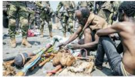
Arrested members of the Wazalendo sect lined up in Goma, Democratic Republic

"These were small individual arrangements, officially