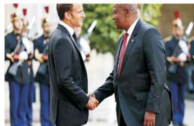
Emmanuel Macron greets President Faustin-Archange Touadéra of the Central African Republic

French President Emmanuel Macron receives his Central African counterpart Faustin-Archange Touadéra on Wednesday against a backdrop of relaunching bilateral relations after years of tension due to the rise of the Russian Wagner militia in this country.