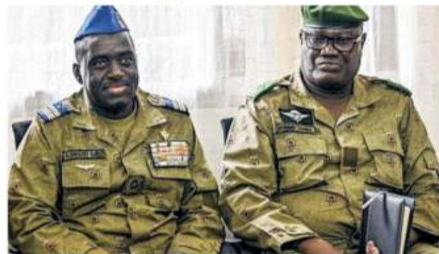
Members of Niger's CNSP, General Mohamed Toumba and Colonel Abdramane Amadou

The military in power in Niger said Tuesday evening that they had denounced a military cooperation agreement concluded in 2022 with neighboring Benin, which they accuse of "considering aggression" against their country.