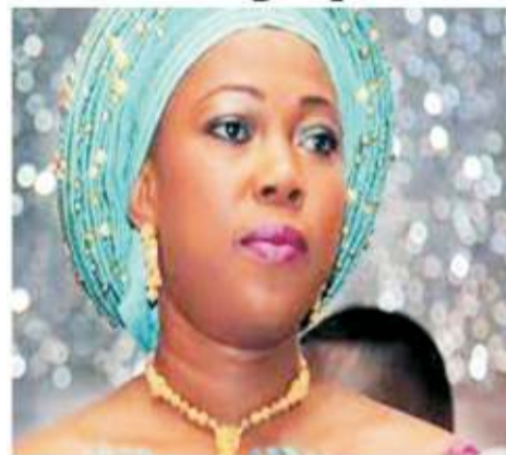
First Lady, Fatima Bio

The Sierra Leone People's Party (SLPP) North America Women's Council is set to host their second annual conference on the 23rd of September 2023, at the Royal Ambassador Banquet Hall, on 2863 Woodbridge Avenue, Edison, NJ 08837.