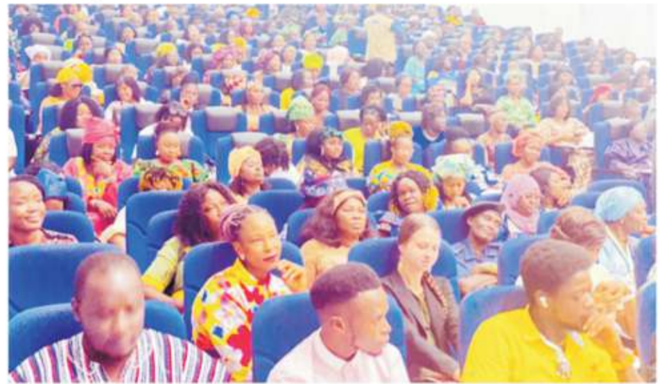
Participants at the conference

The significant rise in female leadership roles following the June 24 general elections is nothing short of