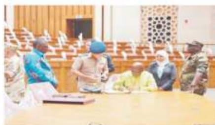
Deputy Minister of Defence- Col (Rtd) MB Massaquoi signs the Memorandum of Understanding on the Joint Military Cooperation with the Egyptian Armed Forces