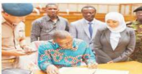
Sierra Leone Ambassador to Egypt HE Sadiq Silla signs the Memorandum of Understanding on the Joint Military Cooperation with the Egyptian Armed Forces

O n Sunday 3rd September 2023, the Deputy Minister of Defence (DMD) Republic of Sierra Leone, Colonel (Rtd) MB Massaquoi and team visited the Egyptian Armed Forces in Cairo in a bid to strengthen defence diplomacy and military cooperation between the Republic of Sierra Leone Armed Forces and Egyptian Armed Forces.