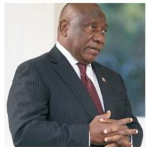
South African President Cyril Ramaphosa at the Vice President's official residence in the U.S. Naval Observatory compound in Washington, Friday, Sept. 16, 2022.

Detrimental effect of accusations "The accusations levelled against our country had a detrimental effect on our currency, our economy and our position in the world," the president stressed. One of the consequences of Brigety's comments was a dip in the value of the country's Rand. "The panel established that the ship docked at Simons Town to deliver equipment that had been ordered for the South African National Defense Force in 2018 by Armscor," Ramaphosa added. The panel's full report will not be released to the public: "Given the fact that the evidence given to the panel was classified and the fact that revealing the details of the equipment offloaded could jeopardize the work and safety of South Africa's forces in various deployment on the continent, I have decided not to release the panel's full report."