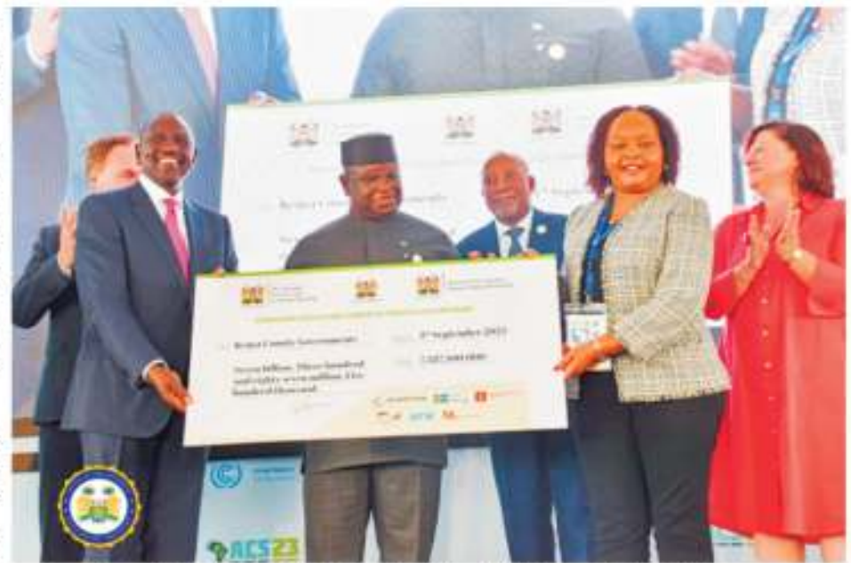
President Bio at the launch of the initiative in Nairobi, Kenya

Earlier at the opening of the Africa Climate Summit, host President His Excellency Dr