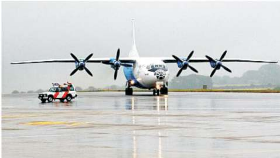
An aircraft on the tarmac at Bristol International Airport, England, Sunday ...

The military regime that emerged from a coup in Niger decided on Monday to reopen its airspace to commercial flights, which had been closed since 6 August, according to the official Niger News Agency (ANP). "The airspace of the Republic of Niger is open to all national and international commercial flights", said a spokesman for the Ministry of Transport, quoted by the ANP, adding that ground services had also resumed. "Airspace is still closed to all operational military flights and other special flights, which are only authorised subject to prior authorisation from the competent authorities", he added. On 6 August, Niger announced the closure of its airspace "in view of the threat of intervention from neighbouring countries", as the Economic Community of West African States (ECOWAS) threatened military intervention to restore the