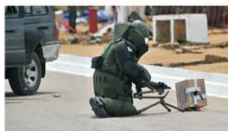
An Ivorian bomb disposal expert of the FRAP special unit (Force de Recherche d'Assaut de la