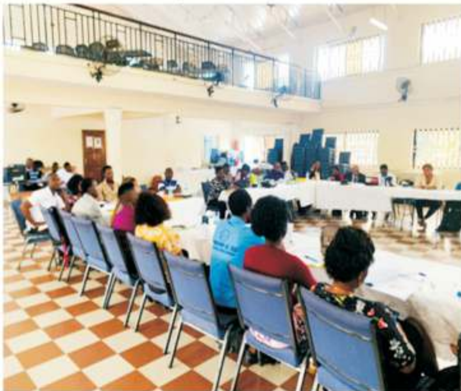
Participants at the training

Human Rights Defenders Network Sierra Leone, has on Wednesday, 30th August, in partnership with Restitution Impact Limited, organised a one-day training for civil society organisations on combating corruption in Sierra Leone.