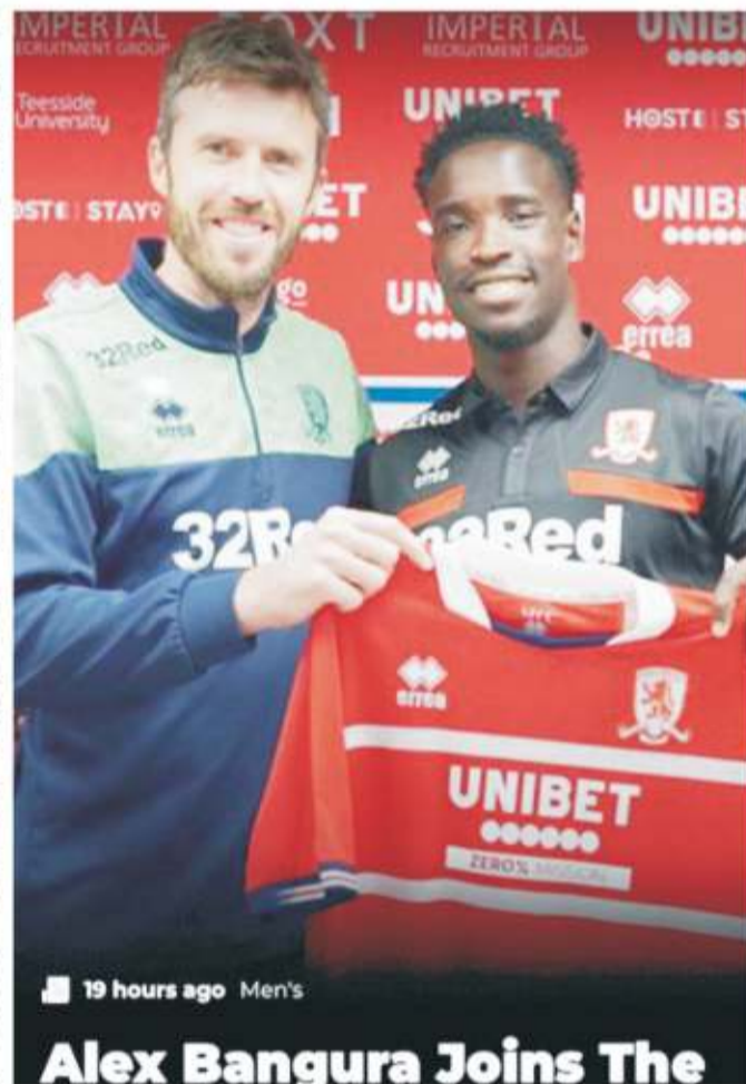
19 hours ago Men's

He brings plenty of experience, having played in the Dutch top division, and he