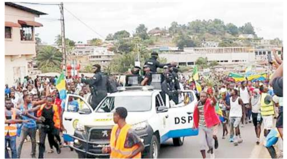
This video grab shows coup supporters cheering police officers in Libreville, Gabon.

After mutinous soldiers in Gabon announced they had deposed the country's president, many residents danced in the streets and declared themselves free from the presidential family's 55-year rule. It's becoming a familiar scene in West and Central Africa, which has recorded eight coups since 2020.