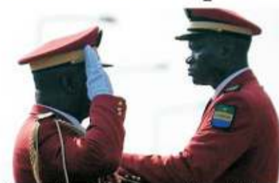
General Brice Oligui Nguema (R) and Gabonese officials salute next to a military vehicle.

"I encourage you to change your paradigm and to ensure that, in the face of the power that I now embody, I am faced with responsible companies, not companies that are created according to the interests and situations of the moment, with the plan of over-invoicing that we all know about and enrichment as has been noted", he added.