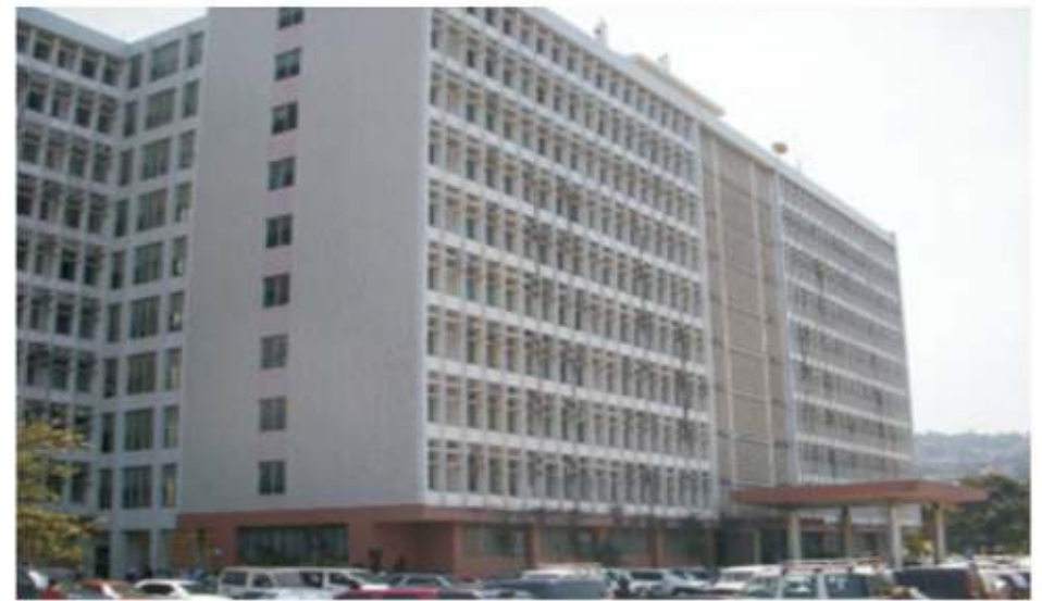
Ministerial Building without elevators

When the elevators were in good condition, I cooked twice a day because most of my customers come to buy food twice a day, but now they only buy once because of the elevators that are not working. I have four children and we all survive on this cookery. Now that there are no elevators in the building, most of my customers ran away because they do not normally climb the building more than twice and that makes my business more difficult. The workers