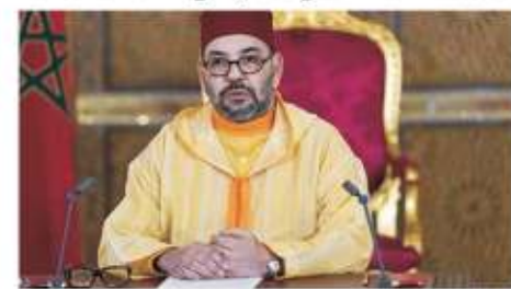
A picture released by the Moroccan Royal Palace shows Morocco's King Mohammed VI.

The Moroccan monarch regularly visits Gabon for private stays. He stayed there for almost three months at the start of the year in his residence on the