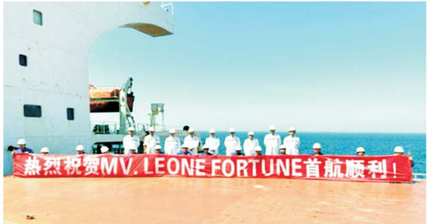
Maiden voyage ceremony