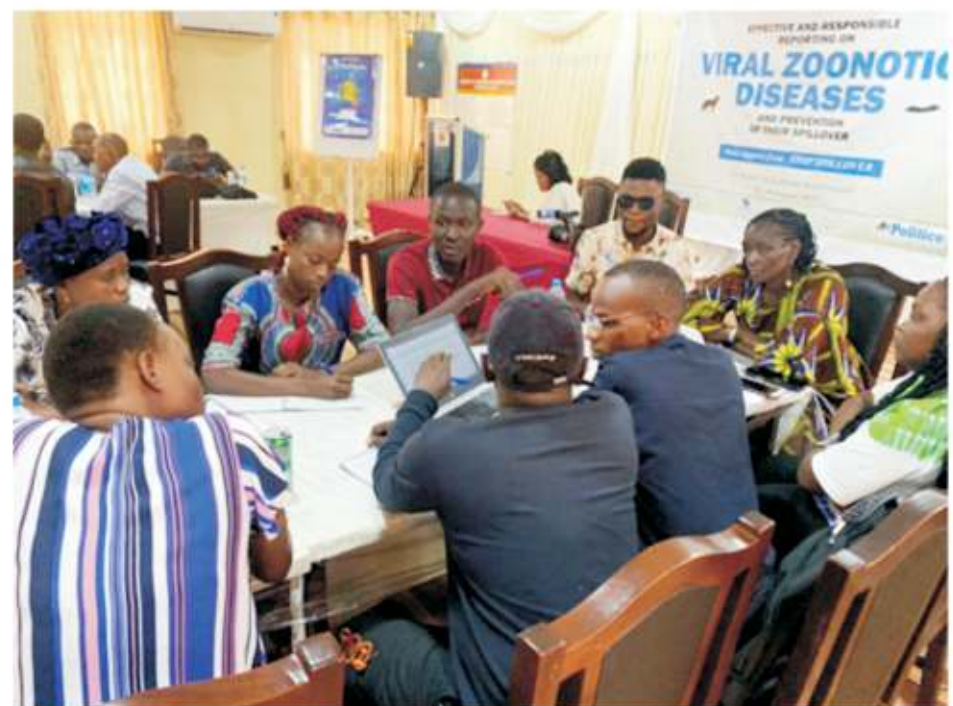
A group of journalists at the training

Animals can sometimes appear healthy even when they are carrying germs