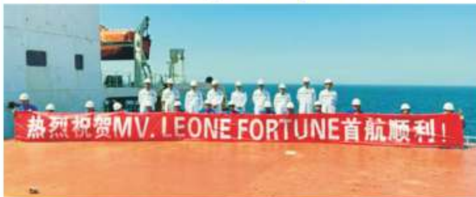
aiden voyage ceremony

Shameful! Youyi Building elevators out of operations