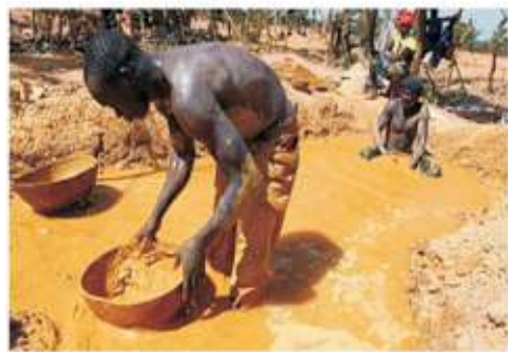
A gold miner pans for gold in Koflatie, Mali, on October 28, 2014, a mine located a few miles from the border with its southwestern neighbour Guinea.

Mali has passed a new mining code allowing the state to take up to 30 percent stakes in new mineral projects and collect more revenues from the vital industry.