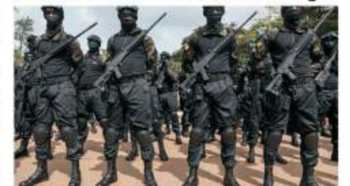
Members of the Rapid Intervention Battalion (Bataillon d'Intervention Rapide, BIR).