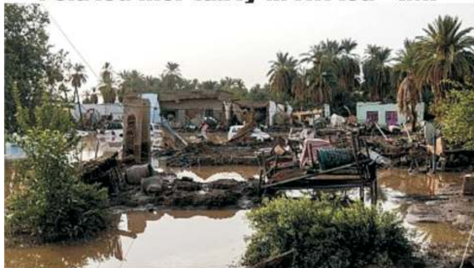
This picture taken on August 6, 2023 shows a view of an area

Climate change could fuel conflicts in countries with the most fragile political contexts and lead to an increase in the number of related deaths, estimates the International Monetary Fund (IMF) in a report published Wednesday. While climate change is not directly identified as a trigger for war, the IMF considers that it "significantly aggravates conflicts and related difficulties", such as famine, poverty, and forced displacement.