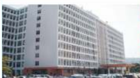
Ministerial Building without elevators

Shameful! Youyi Building elevators out of operations