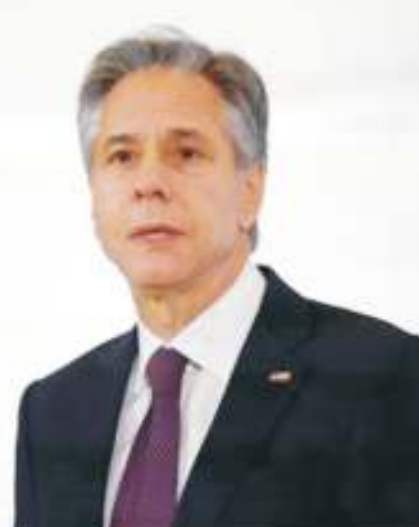
Antony Blinken, US Foreign Secretary

T he United States has placed visa restriction on persons responsible for undermining democracy in Sierra Leone, hinging the outcome of the June 24th general elections in which President Bio was declared winner. A statement issued by the United States Foreign Secretary, Antony J. Blinken states that: "The United States is committed to supporting and advancing democracy in Sierra Leone and around the world. Today, I am announcing a new visa restriction policy under Section 212(a)(3)(C) of the Immigration and Nationality Act for undermining the democratic process in the June 2023 Sierra Leone election."