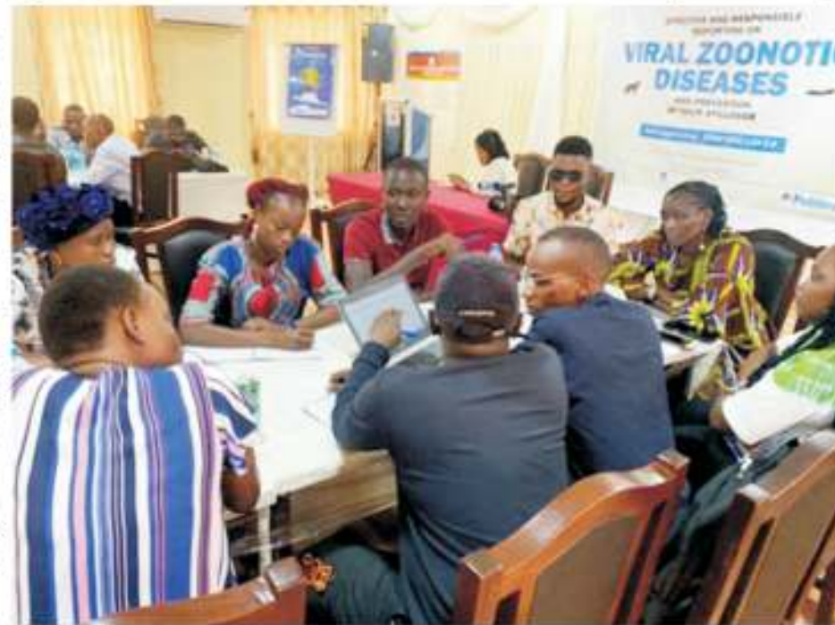
A group of journalists at the training