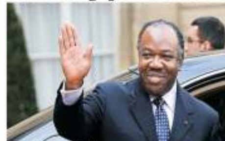
Gabonese President Ali Bongo Ondimba waves as he leaves the Elysee Palace

Bongo "have been arrested", continued the army colonel, who had read out a communiqué during the night announcing that the military were "putting an