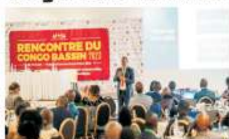
Dr. Million Belay, General Coordinator of AFSA (Advocates for food sovereignty in Africa) on Aug. 29, 2023.

A summit in Dr Congo's capital aimed at protecting central Africa's rainforest kicked off Tuesday. It is attended by activists and politicians.