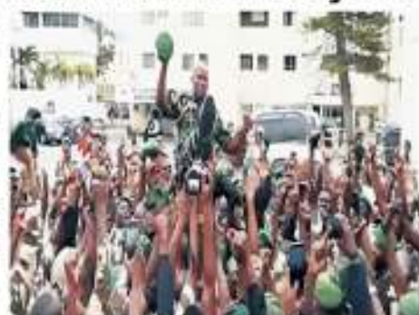
This video grab taken from Gabon 24 on August 30, 2023 shows Gabonese soldiers

Since April 15, 2023, a war due to a power struggle between General Burhane and his former deputy Mohamed Hamdane Daglo has killed at least 5,000 people in the country.