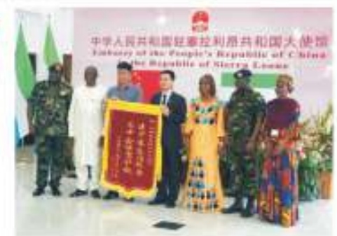
Ambassador Quing, Fishing vessel rep. and Government Ministers

Chinese Embassy celebrates safe return of hijacked vessel