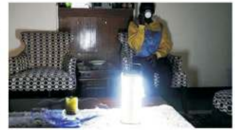
A Kenyan sips a cup of tea as she sits in her sitting room with emergency light as ....

Such an interruption should be immediately compensated by other power generators in the