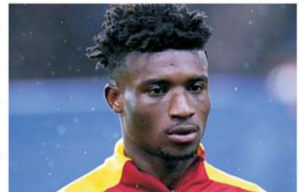
Ghana's Mohammed Kudus poses prior to the international friendly soccer match...

"He's a terrific young talent, who has already shone at the very highest level for Ajax in the