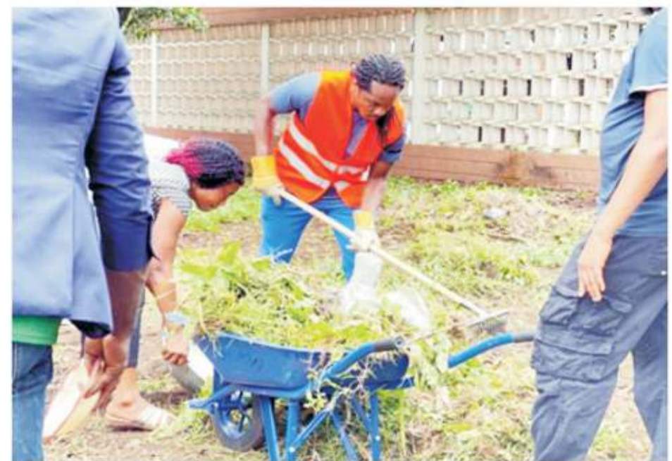
Chief Minister leading the charge to maintain clean working environment

"That was to tell the seriousness of the