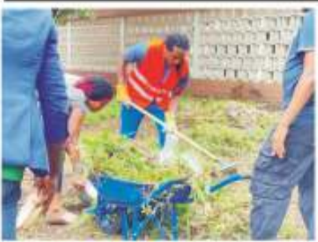
Chief Minister leading the charge to maintain clean working environment