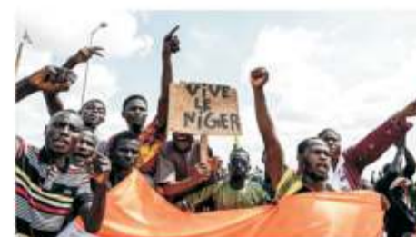
Supporters of the Niger's ruling (CNSP) wave a placard that reads "Long live Niger" as they demonstrate outside the Niger and French airbases in Niamey on Aug. 27, 2023.

troops from Niger. That's what I've come to demonstrate today," a protester said.