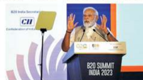
Indian Prime Minister Narendra Modi speaks at a special session of the Business 20 or B20

The Indian Prime Minister also affirmed that his