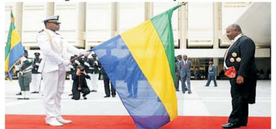
Gabonese President-elect Ali Bongo Ondimba at the flag during the swearing-in ceremony

Five things to know about Gabon, an oil-rich Central African country, where President Ali Bongo Ondimba is seeking a third presidential term on August 26.