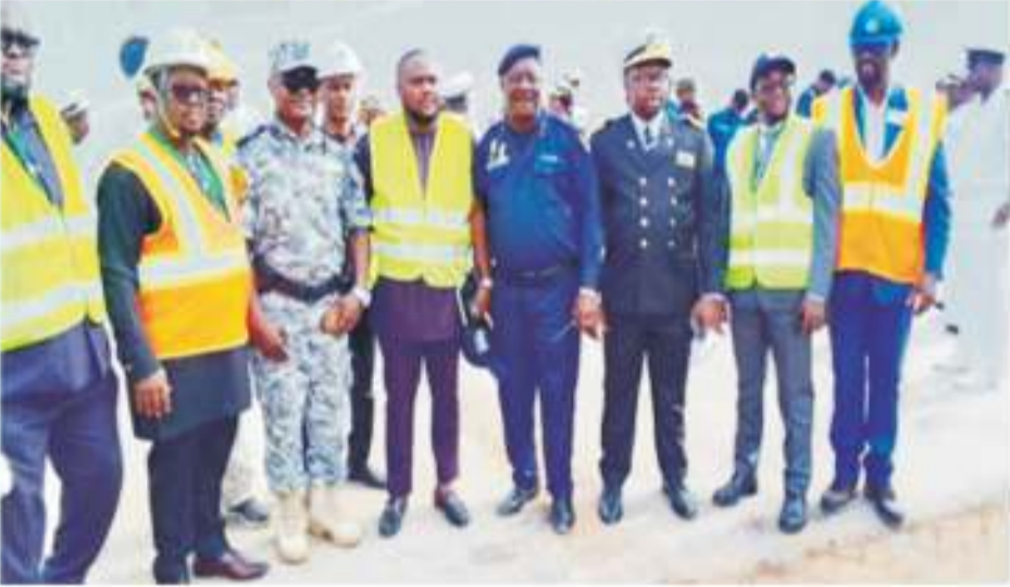
SLPA officials welcoming Mercy Ships delegation

Sierra is in dire need of healthy investment that would open up opportunities for citizens and create more jobs for the growing number of youth. As a way of enhancing a conducive atmosphere for investment to thrive, the Government of Sierra Leone, through an Act of Parliament, established the National Investment Board (NIB) in 2022, an institution that is charged with the responsibility of facilitating investment and creating the enabling environment for investor confidence. The institution would serve as a one-stop-shop to reduce the burden on investors to set up their businesses in the country. The National Investment Board is headed by an apt academic, Professor Marda Mustapha, who serves as the Executive Director. Professor Mustapha is an expert in International Political Economy (PHD) and has been teaching in the United States for