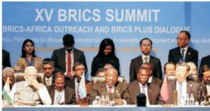
Indian PM Narendra Modi, President Cyril Ramaphosa, Deputy President of South Africa Paul Mashatile and President of China Xi Jinping attend a meeting in Johannesburg

Immediately after the announcement, Teheran hailed on X (formerly Twitter) "a strategic success