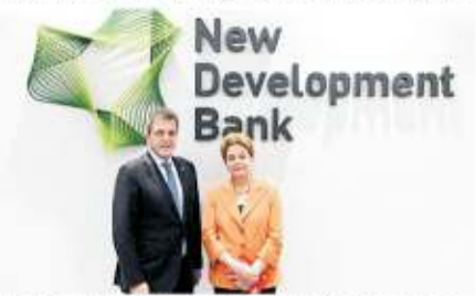
This handout picture released by the Argentine Economy Ministry shows ...

She also highlighted the necessity of bolstering payment mechanisms, particularly through the introduction of local currencies and innovative financial tools. These measures are envisioned