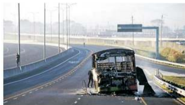
A bus burns on a motorway in the suburbs of Cape Town, South Africa, 7 August 2023

The port and tourist city of Cape Town has been paralysed for several days by a collective taxi strike, which has taken a violent turn in South Africa's largest city with three deaths reported, the police announced on Monday.