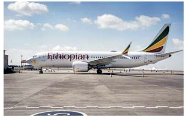
file photo from 23 March 2019, an Ethiopian Airlines Boeing 737 Max 8 is on the tarmac at an airport.

Shops were looted, according to the police, who announced the arrest of five suspected looters. Following the failure of weekend negotiations with Santaco, it announced that the work stoppage would continue until Wednesday.