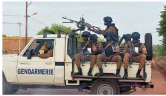
A photo taken on October 30, 2018 shows Burkinabe gendarmes sitting on a white pickup truck with "GENDARMERIE" written on the side.

Another attack occurred "Thursday around 6 p.m.", according to the same security source, and "targeted a convoy of several dozen vehicles carrying goods".