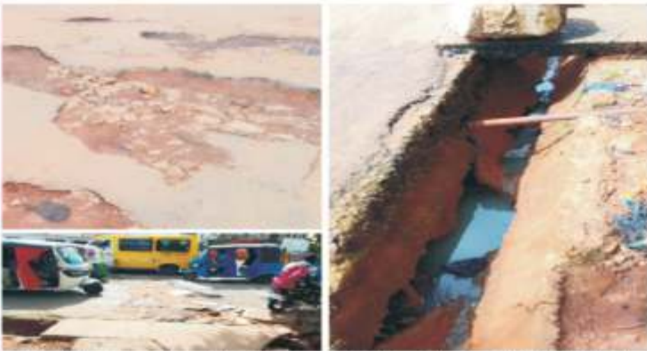
Potholes, gutter without slabs and vehicles struggle to make their way through spotted during the interview