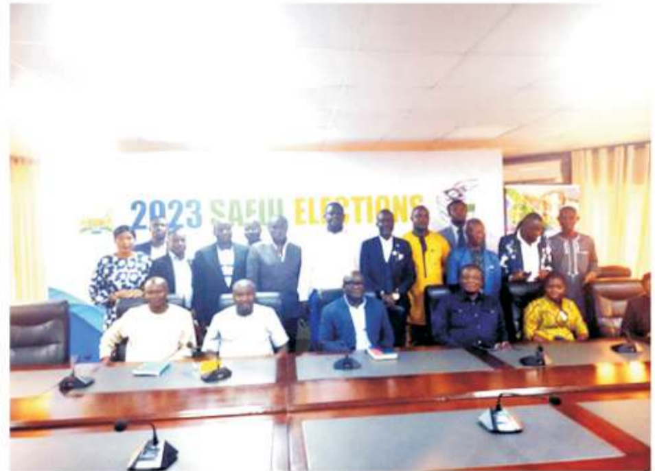
A cross section of APPA members

He said those who didn't win should embrace the winner and make their