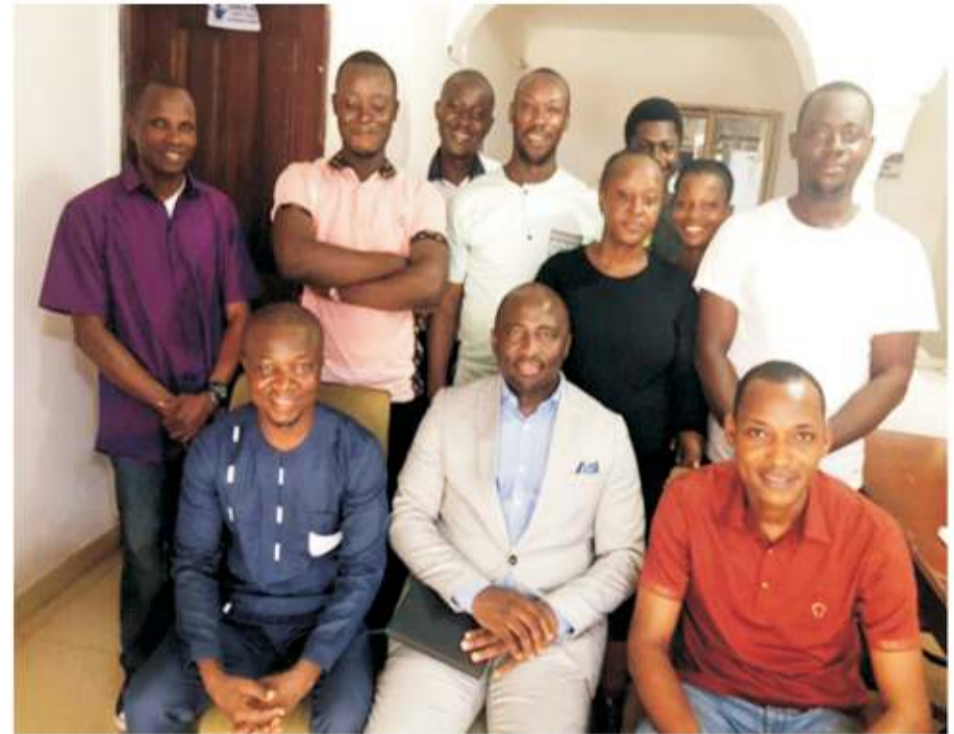
A group picture of Concord Times staff and the visitors

The Editor, Concord Times, expressed delight for the courtesy visit, noting that it was the first time a press secretary to the president ever embarked on such a tour.