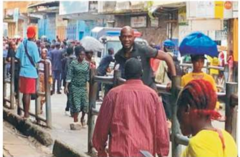
Traders running helter-skelter

New Mines Minister receives accolades in parliament