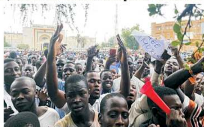
Supporters of mutinous soldiers demonstrate in Niamey, Niger, on 27 July 2023.

France withdraws its troops from the country in the summer of 2022, where public opinion is increasingly hostile to it. In June 2023, Malians