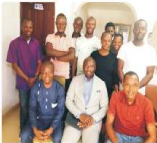
A group picture of Concord Times staff and the visitors

State House Press hobnobs with Concord Times