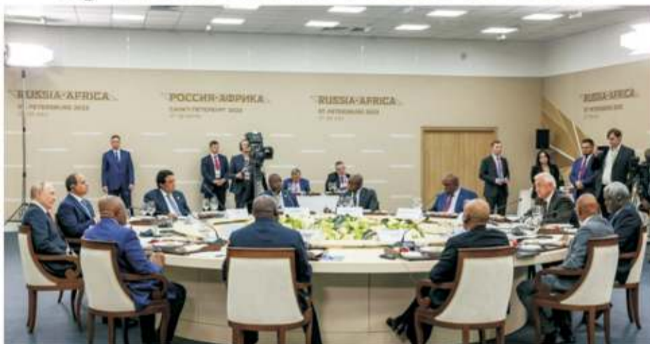
Russian President Vladimir Putin chairs a working breakfast with heads of African regional organizations during the second Russia-Africa summit in Saint Petersburg on July 27,

Russian President Vladimir Putin said the trade turnover between Russia and African countries had increased by almost 35% in the first half of 2023 despite international sanctions and the fallout from the COVID-19 pandemic.