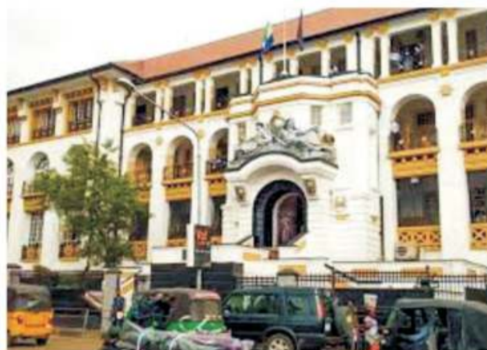
Law court building SL