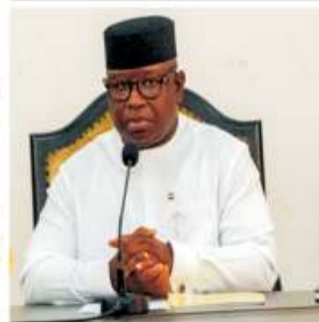
President Julius Maada Bio

President Bio further explained that before he resumed office in 2018, the commission was incapacitated, and there were a lot of challenges ranging from electricity to other administrative challenges, but as soon as he took over governance, he made sure that some of