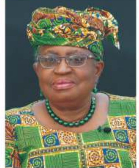
Director General of World Trade Organisation (WTO) Okonjo-Iweala