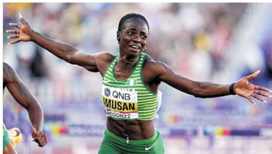
FILE - Tobi Amusan, of Nigeria, wins the women's 100-meter hurdles final

World-record hurdler Tobi Amusan says she has been charged with an anti-doping rules violation for missing three drug tests in the span of 12 months.