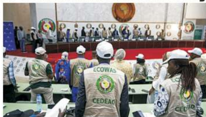
Members await the arrival of dignitaries during a joint press conference by

Supported by Niger, Nigeria, Benin, and Guinea-Bissau have set up a tripartite commission to find alternative security solutions after the withdrawal of the UN mission in Mali, including the possible deployment of soldiers from countries of ECOWAS.