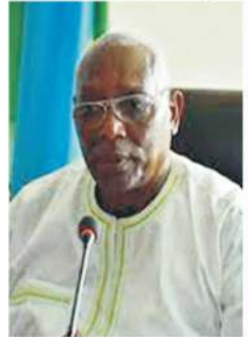
House Speaker, Abass Bundu

The Speaker of the Sierra Leone Parliament, Dr. Abass C. Bundu, has charged that reasons behind the international community's involvement in the current political situation in the country is merely to protect and promote their own interests and not the interest of Sierra Leoneans.