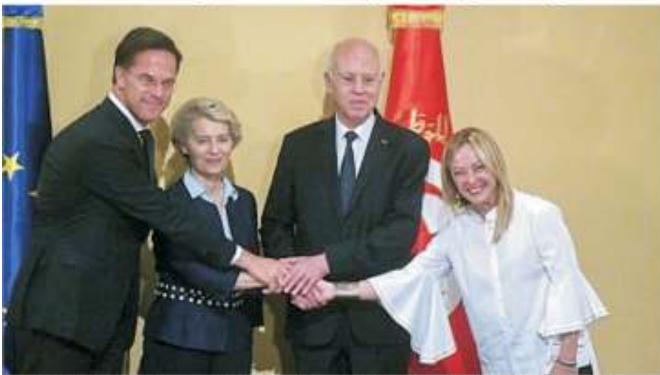
Kais Saied shakes hands with Mark Rutte, Ursula von der Leyen and Giorgia Meloni

The European Union wishes to negotiate with Egypt and Morocco partnerships similar to the one it has just concluded with Tunisia, relating in particular to the fight against irregular immigration, a European source said on Monday.