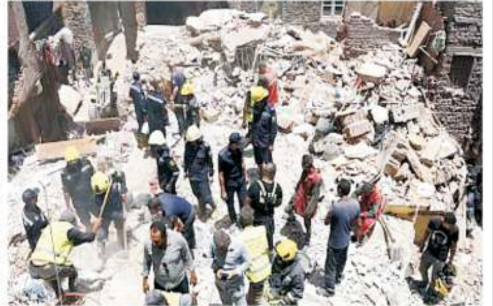
Rescuers search through the rubble of a collapsed five-story apartment building...

A five-storey building collapsed in the Egyptian capital Cairo on Monday, killing at least nine people, authorities said, as rescuers dig through the rubble.