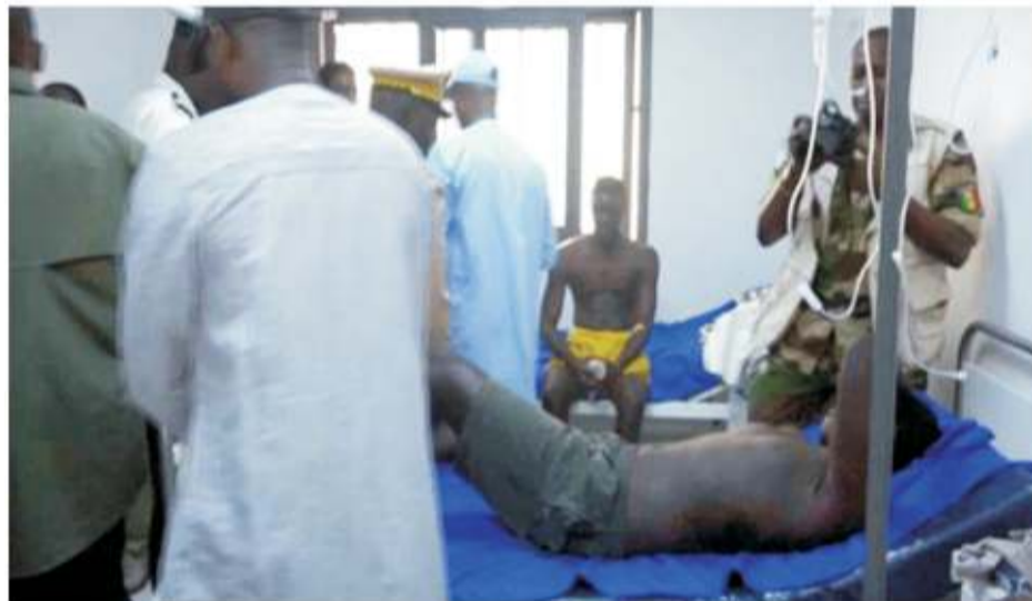
Injured from capsized pirogue

The Senegalese government announced on Friday that the death toll had risen again, to 14 and four injured, following the capsizing of a pirogue on Wednesday in Saint-Louis (north), on the migratory route linking the country to the Spanish archipelago of the Canaries.