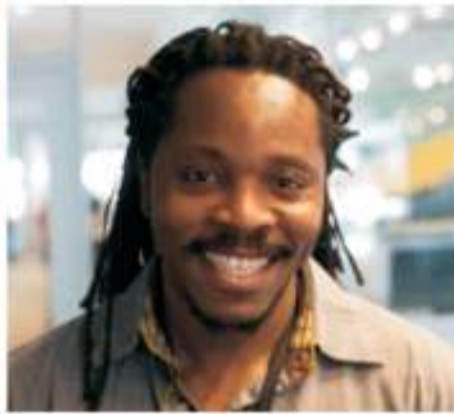
David Sengeh, Chief Minister