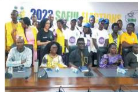
AYV staffs, ECSL commissioners & Cypher team pose for photo

He stated that the cypher guys are not just voice of the street, but they are serious people as some