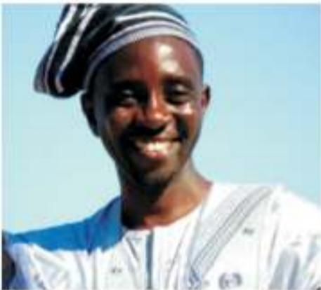
New Minister of Information