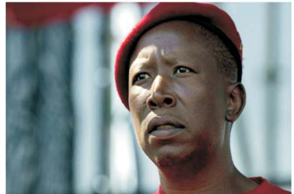
Julius Malema, leader for Economic Freedom Fighters (EFF) addresses supporters at a May day rally in Alexandra, South Africa, Wednesday May 1, 2019.

Could South Africa's proposed opposition coalition include the country's third largest party to oust long-time ruling ANC next year?