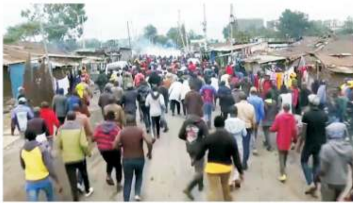
Protesters in Nairobi

Nairobi police commander Adamson Bungei told The Associated Press on Friday that "more than