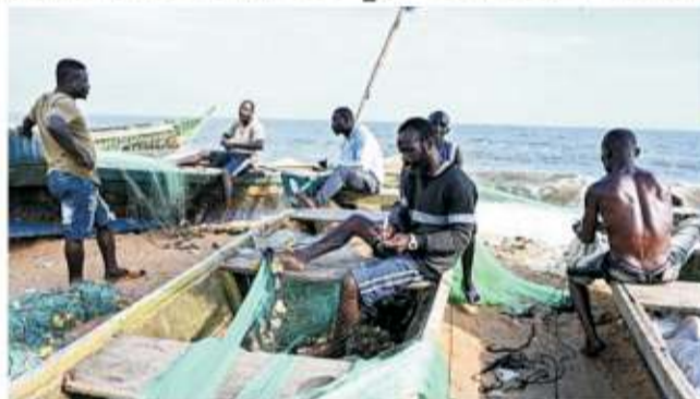
Artisanal fishermen, mend their nets on Abidjan's Port-Bouet beach on July 7, 2023.