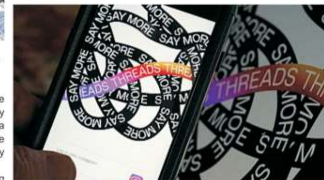
This photo, taken in New York, Thursday, July 6, 2023, shows Meta's new app Threads.

Twitter has threatened legal action against Meta over its new text-based app called Threads, which has drawn tens of millions of users since launching this week as a rival to Elon Musk's social media platform.