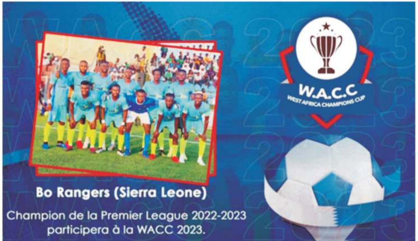
Bo Rangers (Sierra Leone) Champion de la Premier League 2022-2023 participera à la WACC 2023.