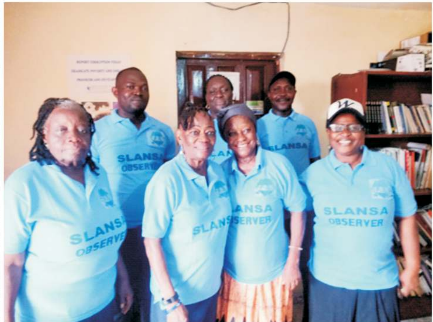
A team of SLANSA election observers

They called on ECSL to ensure that the master register should be produced to have surnames of all registered voters in all polling stations to avoid movement of voters from place to place searching for their surnames.