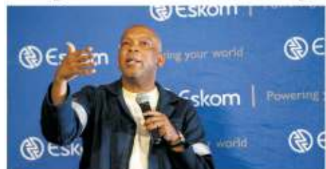
Electricity Minister Kgosientso Ramokgopa addresses Eskom workers during a visit to the Lethabo Power Station near Sasolburg, South Africa, on March 23, 2023.

South Africa could be nearing the end of daily power cuts, the country's electricity minister said on Sunday.