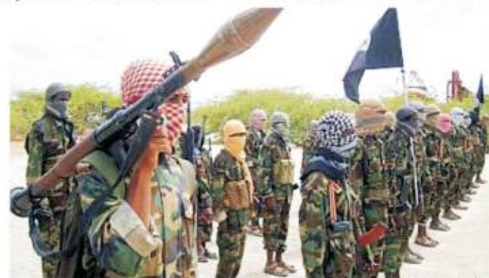
Photo of Thursday 21 October 2010: Al-Shabaab fighters display ...

Since its military intervention in southern Somalia in 2011 and then its participation in the African Union force in Somalia (Amisom, now Atmis) created in 2012 to combat