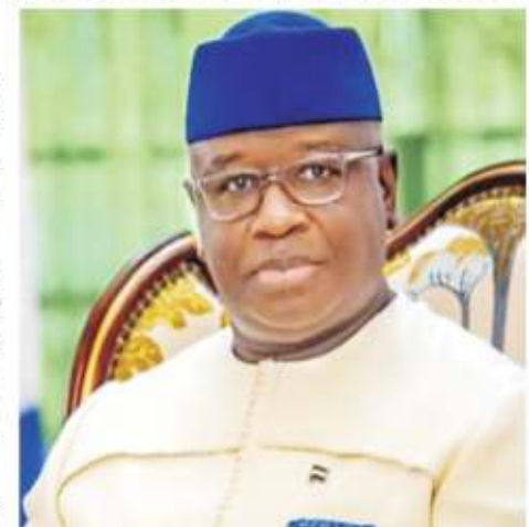
President Julius Maada Bio

He said citizens must not incite violence