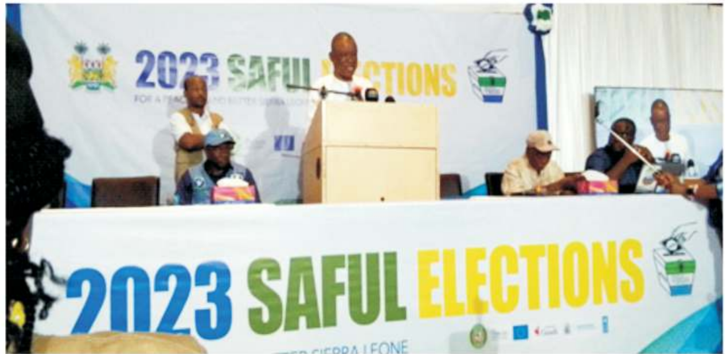
PPRC Chairman updating the press on their findings

country. There were delays in a few polling stations in the Western Urban and Western Rural and polling started late. However, the