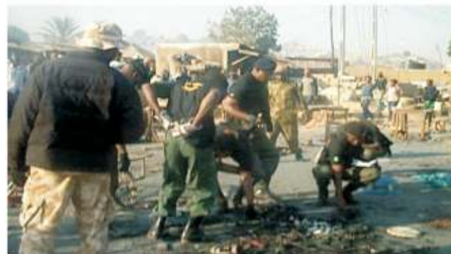
A team of military and police bomb squad pick up pieces of detonated explosives....

A man was stoned to death after being accused of blasphemy in northwest Nigeria, authorities and activists said, sparking outrage on Monday from rights groups worried about what they said were growing threats to religious freedom in the region.