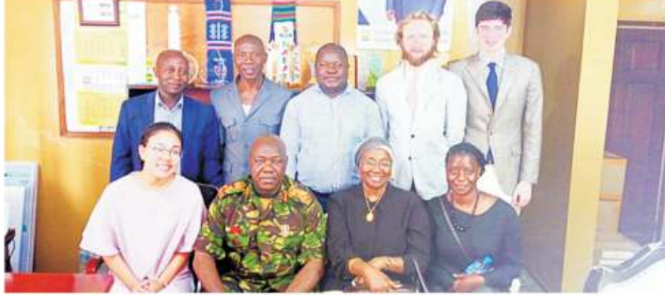
A team comprising tutors from the Broad Institutes and COMAHS with the USL VC&P

those students who would not be able to country. and Masters would be able to graduate close of the training in Bo, the Minister transformation in the country.