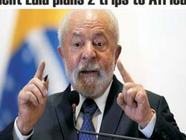
Brazilian President Luiz Inacio Lula da Silva at the South American Summit at the Itamaraty Palace in Brasilia, Brazil, 30 May 2023.

It is clear that Brazil wants to expand its economic cooperation with the continent in line with President Lula da Silva's South-South integration