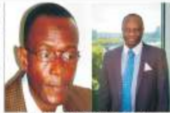
Both ReNIP & NDA flagbearers

ReNIP, NDA leaders disassociate from claims of aligning with SLPP