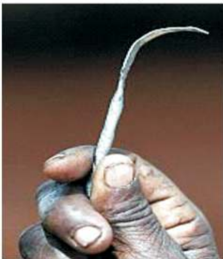
Ex-female genital mutilation (FGM) cutter Monika Cheptiak, who stopped practicing after the country set anti-FGM law in 2010.

In Egypt, campaigns are calling for little girls no longer to be circumcised. But while the state wants to protect future generations, the 28 million women who have already been mutilated have only one private clinic to help them.