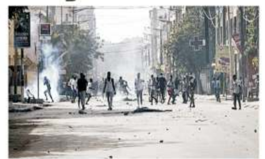
Demonstrators gather during a protest in Dakar, on June 1, 2023.

Pro-Sonko supporters accuse the presidential camp of having paid these "thugs" to assist the police and