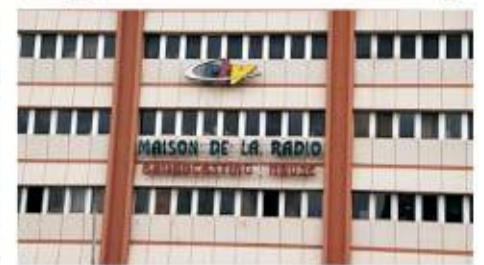
Cameroon's national radio and TV headquarters building is pictured on July 25, 2022, in Yaounde.

Cameroon, like many other African countries, receives many foreign channels via subscriptions to the packages offered by the French group Canal+ and the South African group DSTv, as well as a number of other small private operators selling