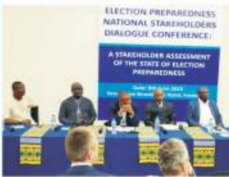
ELECTION PREPAREDNESS NATIONAL STAKEHOLDERS DIALOGUE CONFERENCE! A STAKEHOLDER ASSESSMENT OF THE STATE OF ELECTION PREPAREDNESS