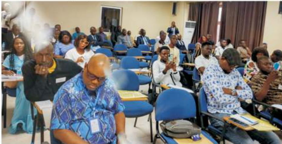
Journalists from across the country at the workshop

invest further in the financial, noting that the second financial project is about to start and it will complement the national switch and support technical infrastructure and also small businesses.