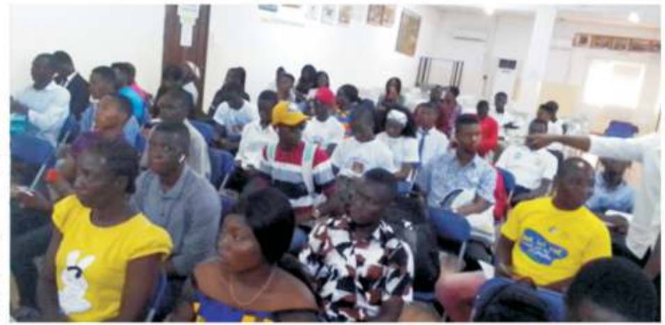
Youths listening to SLAJ president while advising them

While speaking on harnessing technology for positive change, he said young people