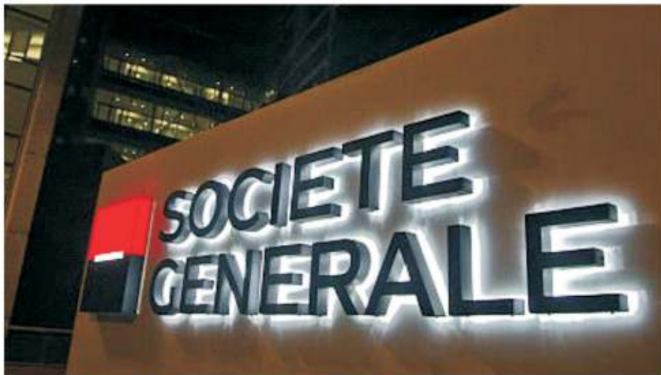
The Société Générale bank logo is pictured in the La Défense business...

Societe Generale has announced the conclusion of agreements with two African banking groups to sell four of its subsidiaries to them. They are found in Congo, Equatorial Guinea, Mauritania and Chad. Societe Generale announced on Friday the conclusion of agreements with two African banking groups to sell them four of its subsidiaries. Two will be in Congo and Equatorial Guinea at the Vista group, the others in Mauritania and Chad at the Coris group. The two groups "would take over all the activities operated by Societe Generale in Congo, Equatorial Guinea, Mauritania and Chad, as well as all the client portfolios and all the employees within these entities", explains a press release of the bank, which also announces the opening of a strategic reflection on its subsidiary in Tunisia.