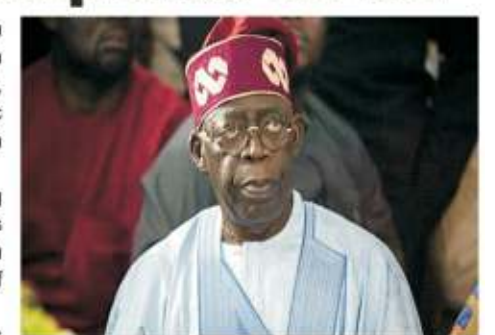
FILE- Bola Tinubu, of the All Progressives Congress, meets with supporters...

Nigerian President Bola Tinubu on Wednesday defended the West African nation's decision to stop subsidizing fuel, a move that already is adding to economic hardships by pushing up prices for transportation and commodities. The money saved by ending the decadeslong subsidy last week will help the government's efforts to fight poverty and its initiatives, Tinubu told governors in a meeting in the capital city of Abuja. He appealed for patience even though hardship is biting harder on millions of citizens. "We can see the effects of poverty on the faces of our people. Poverty is not hereditary, it is from society. Our position is to eliminate poverty," a statement from the Nigerian presidency quoted Tinubu as saying.