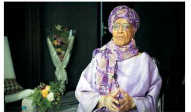
Ellen Johnson Sirleaf in interview with Africanews

An African geopolitical situation in perpetual motion, the