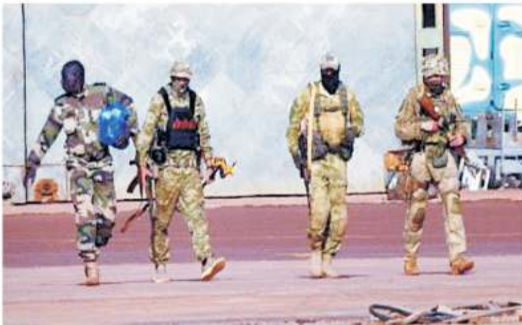
This undated photograph distributed by the French army shows three Russian ...

This is not the first time that sanctions have targeted the Wagner group or some of its members for its actions in Mali. The European Union had thus announced at the end of February a series of sanctions targeting a dozen