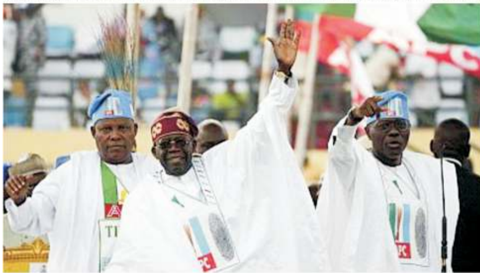
Bola Ahmed Tinubu greets his supporters during an election campaign...

The resurgence of massive attacks by criminal and jihadist groups in Nigeria, a time slowed down during the electoral period, is a cruel reminder of the immense challenges that await the new President Bola Tinubu as of Monday at the head of the most populous country in Africa.