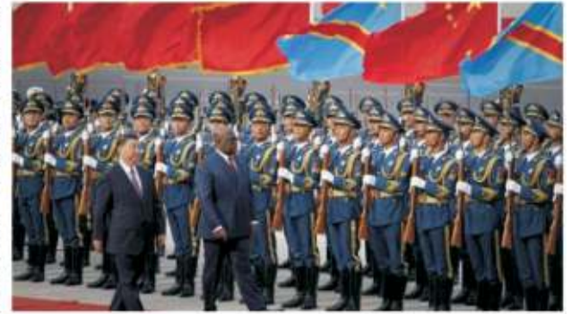
Republic of Congo's President Felix Tshisekedi & Chinese President Xi Jinping attend a welcoming ceremony at the Great Hall of the People in Beijing, May 26, 2023.

The large central African country is a major exporter of copper, uranium and cobalt - a key ingredient in batteries for consumer goods - but remains one of the world's poorest states.