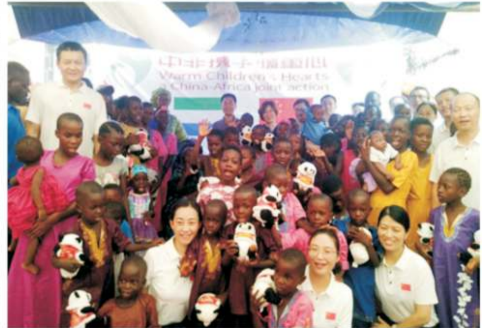
Chinese team and kids at the Orphanage