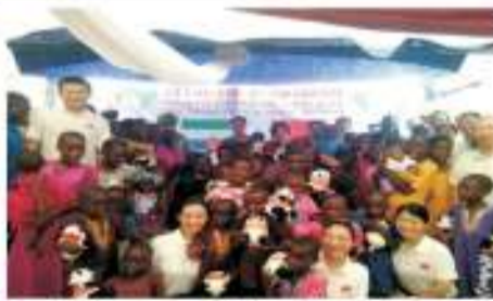
Chinese team and kids at the Orphanage

Chinese Embassy donates to the Children in Need Network Orphanage