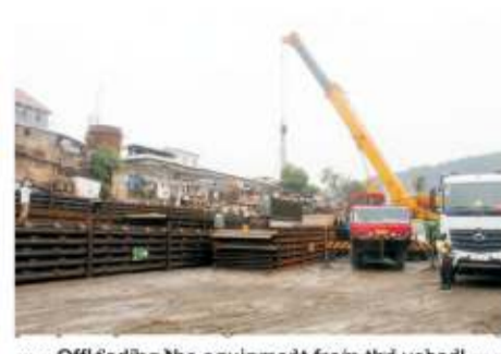
Offloading the equipment from the vessel.

He said the project is a direct response to the vision of the President Bio Human Capital Development with focus on middle manpower by training young