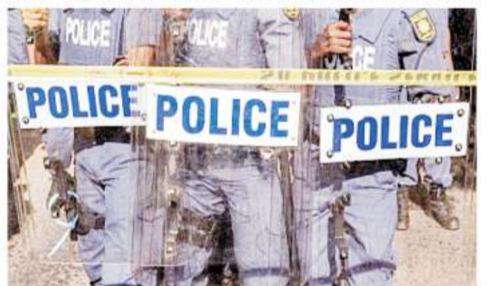
South African police officers prepare riot gear as the EFF demonstrates outside the...

"I need a cold drink," says the policeman to the driver, nonchalantly leaning against the lowered window. The sun is beating down on the windscreen of the car that has been stopped for a while on the side of a busy Johannesburg road. Under his cap with the glittering SAPS (South African Police Services) logo, the officer is clearly making it clear that he has plenty of time. Spinning a set of keys on one finger, he chews gum tirelessly.