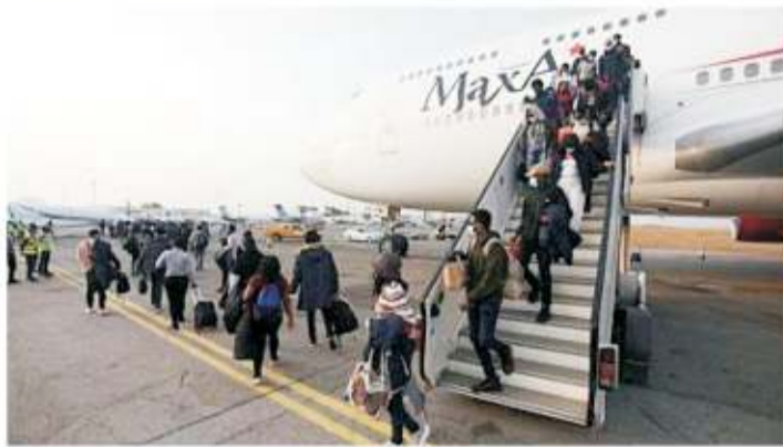
Nigerian students, who just got evacuated from Ukraine amidst the ongoing war ...

If implemented, the crackdown will affect many Nigerian students hoping to pursue their postgraduate studies in the UK, as they accounted for the highest increase in the number of dependants accompanying persons with study visas in 2022.