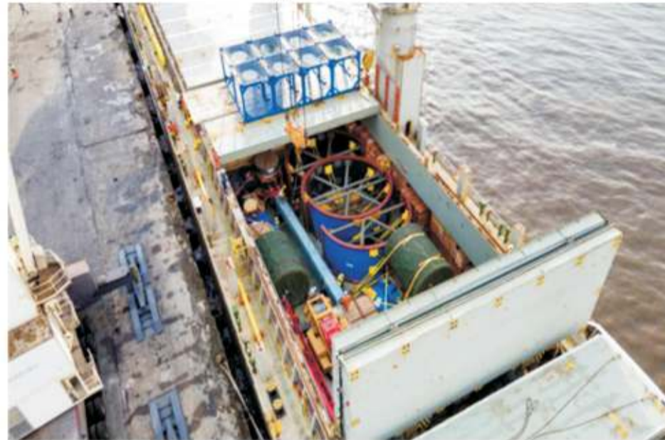
Footage of equipment of Marapa Mines at the Freetown Terminal

All of the M3.75 Equipment has been designed specifically to meet the growing demands from the international markets for high grade iron ore, which is a key