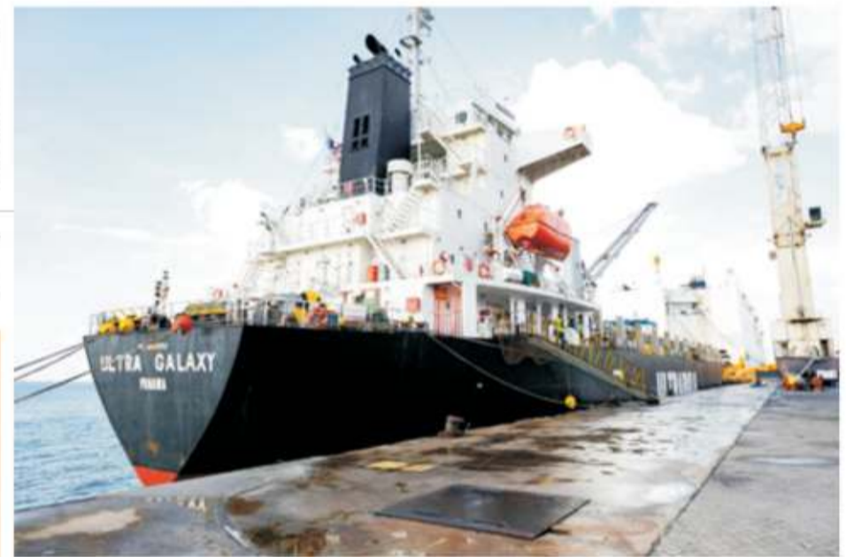
Vessels carrying the equipment of Marampa Mines rightly positioned to be in full charge of the rail and port.

While President Bio has promised to prioritise agriculture if elected for the second term, the public is patiently waiting to see the difference the new manifesto will make going forward.