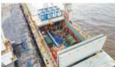
Footage of equipment of Marampa Mines at the Freetown Terminal