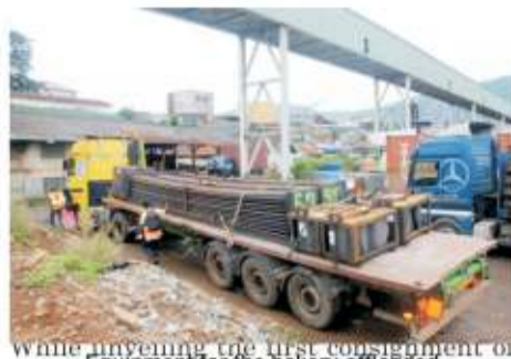
While unloading the first consignment of equipment for the bakery offloaded from a vessel at Queen Elizabeth Quay.

the SONOCO Managing Director said despite circulating rumours of its demise, the ambitious project in Sierra Leone has defied skeptics by transforming into a tangible reality. He said despite the Covid-19 Pandemic and the Coup in Guinea, building a factory from scratch requires long process.