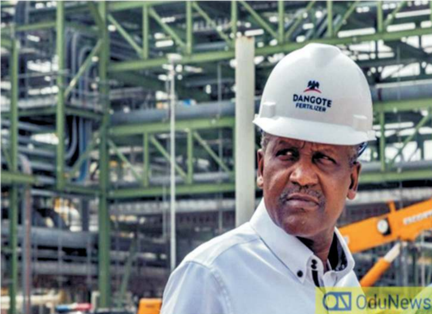
President/Chief Executive of Dangote Industries Limited, Aliko Dangote

The billionaire businessman said the project was the realisation of a "clear opportunity" for Nigeria