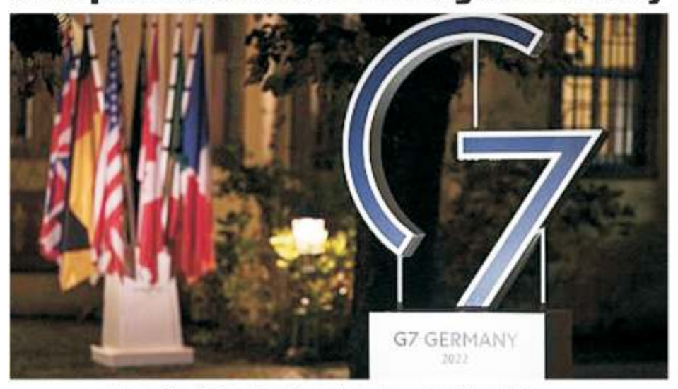
A Logo of the G7 with national flags in the background are pictured during ...

7 leaders convene in Japan to access to essential services for citizens, including the Ukraine invasion, underserved areas. climate change, and food insecurity.