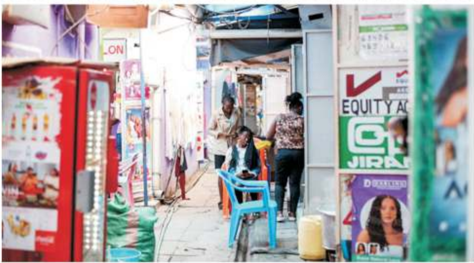
A client has her hair plaited at a beauty salon in Nairobi on May 15, 2023.

hat do artificial nails, crypto currencies, spaghetti and social media influencers have in common?