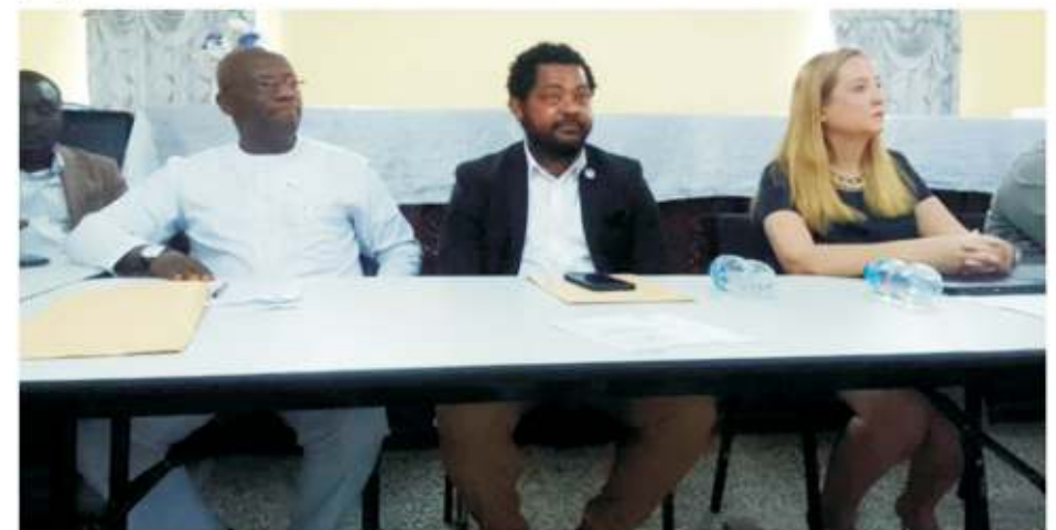
IMC, Chairman (L), SLAJ President (M) & Ireland Ambassador (R) sitting at the high table