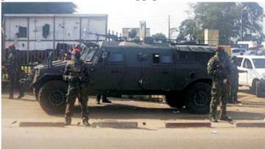
Soldiers stand guard outside a meeting led by Colonel Mamady Doumbouya ...

T he ruling junta in Guinea commandeered the army on Wednesday in the face of fresh opposition protests, and threatened to apply anti-terrorism laws providing for up to life imprisonment against those responsible for a "crisis situation".