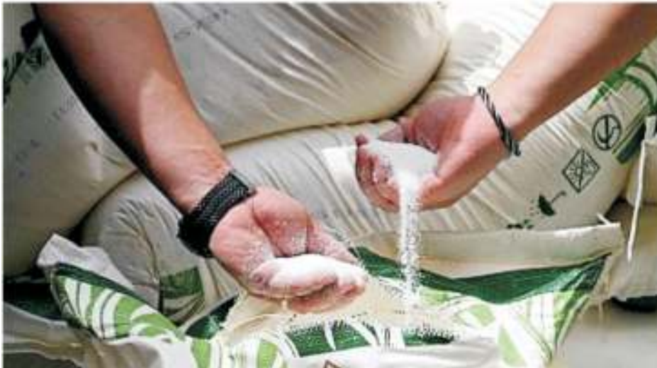
Officers pose as they inspect a shipment of refined sugar from ...

K enya authorities have suspended 27 civil servants on suspicion of misappropriating about 1,000 tonnes of sugar that was declared unfit for consumption, the country's director of public service said on Wednesday.