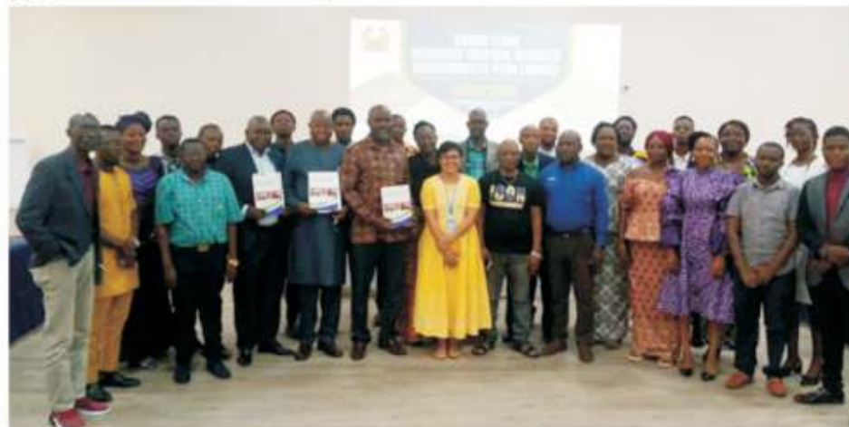
Team from the MoHs Helen Keller Intl, and partners

days ago, the World Health Organization announced that a West African neighbor, Mali has been declared free of blinding trachoma – a scourge that was endemic in every district of the country 20 years ago," he said.