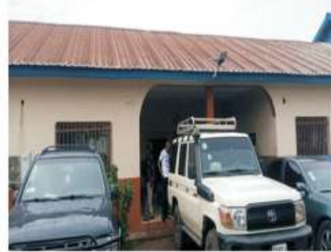
The Transnational Organized Crime Unit in Sierra Leone

trafficking crimes remain rife, while less cases are being charged and prosecuted. Victims or their relatives file complaints but how those complaints are being handled does not seem satisfactory to some members of the public. Some sources who have filed complaints to TOCU spoke to me, expressing dissatisfaction with the way their complaints have been handled.