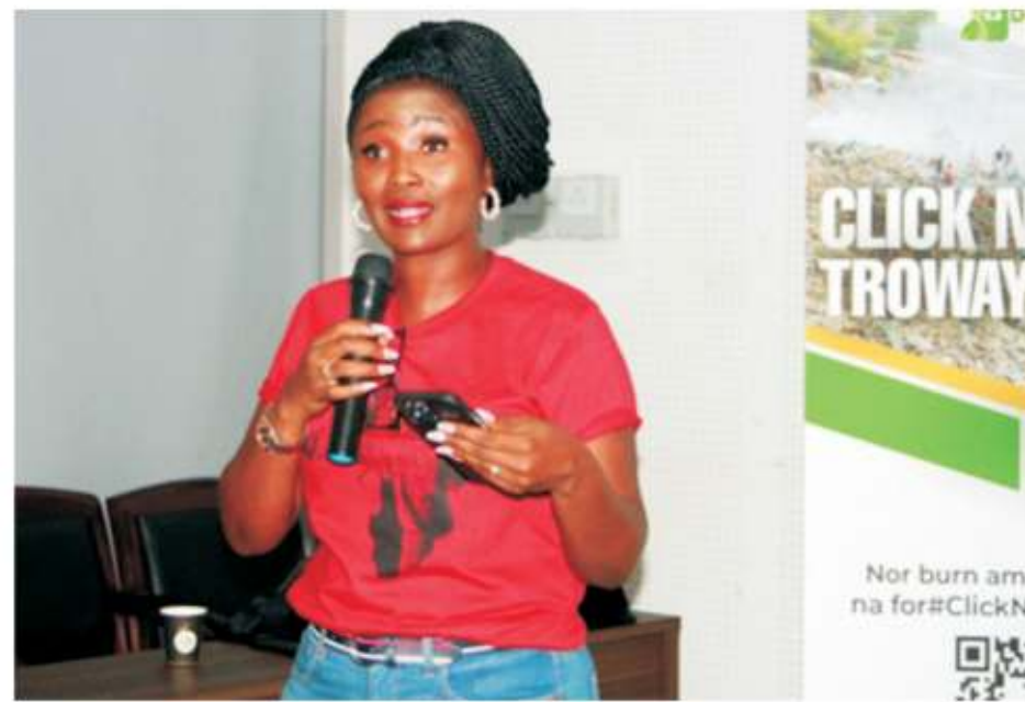
CEO of Freetown waste transformers

including some corporate enterprises and that 800 people were trained with 80 tricycles given to them.