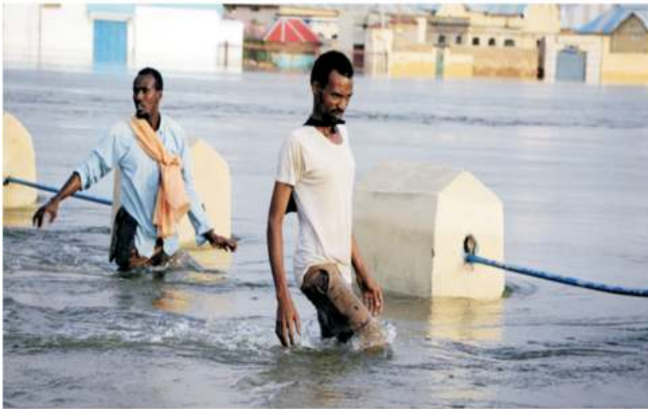
Rising water level in Beledweyne forced a number of important facilities to close in the town including government offices and the main hospital - Copyright © africanews AP/

F loodwaters in central Somali left thousands of families displaced in Beledweyne, the city with the highest population density in the region.