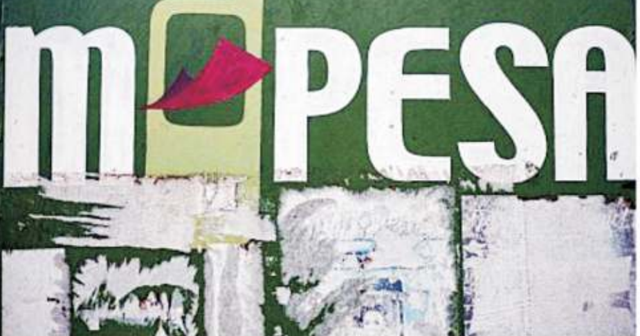
A general view of Safaricom's mobile money service M-Pesa logo, ...

During this time the Shabelle-Juba river basins saw their lowest rainfall totals since 1981.