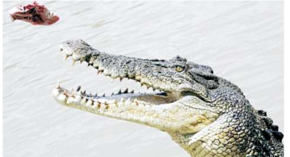
A saltwater crocodile snaps at a piece of meat on the Adelaide river, 60 kilometers from the farm where it was found.

T hree men have been arrested in South Africa for stealing a 2.5-meter (8-foot) long Nile crocodile worth about $1,300 from a farm in the North West province, police said Monday.