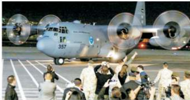
A Jordanian military aircraft carrying people evacuated from Sudan arrives at an airport in Amman on April 24, 2023

Sweden's defence minister told AFP on Sunday "140 to 150" soldiers were mobilised to evacuate diplomats and