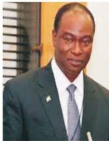
Dr. Samura Kamara of APC

The Presidential flagbearer of the All People's Congress Party (APC), Samura Mathew Wilson Kamara, has paid visit to the tribal leaders of Bramala Chiefdom, Kukuna and Kabaya in Kambia District ahead of the June 24th election.