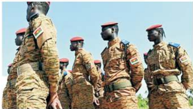
Burkina Faso soldiers take part in the annual US-led Flintlock military training ....

T he government of Burkina Faso has announced that it will take a new approach to the fight against terrorism, with the aim of reducing the number of people killed in the country's wars.