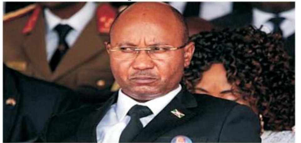
Burundi's new prime minister Alain-Guillaume Bunyoni attends the national assembly.

A former Prime Minister of Burundi, Alain-Guillaume Bunyoni, wanted for several days by the courts without the authorities communicating the reasons, has been arrested, announced on Saturday the National Independent Commission for Human Rights (CNIDH) and a senior security official.