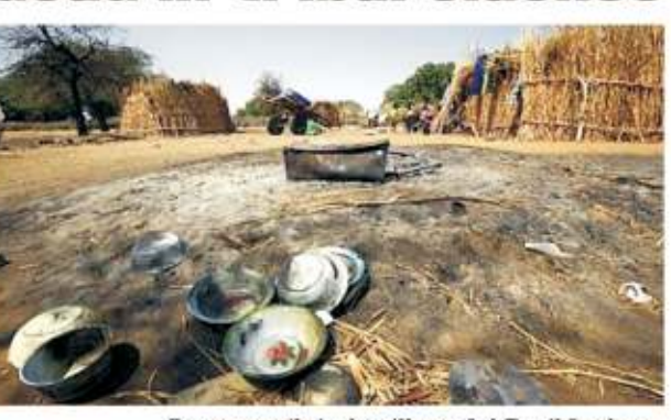
Burnt utensils in the village of al-Twail Saadoun. 85 km south of the city ....

A 2003 civil war between the regime of Omar al-Bashir, which falls in 2019, and insurgents from ethnic minorities left an estimated 300,000 people dead and nearly 2.5