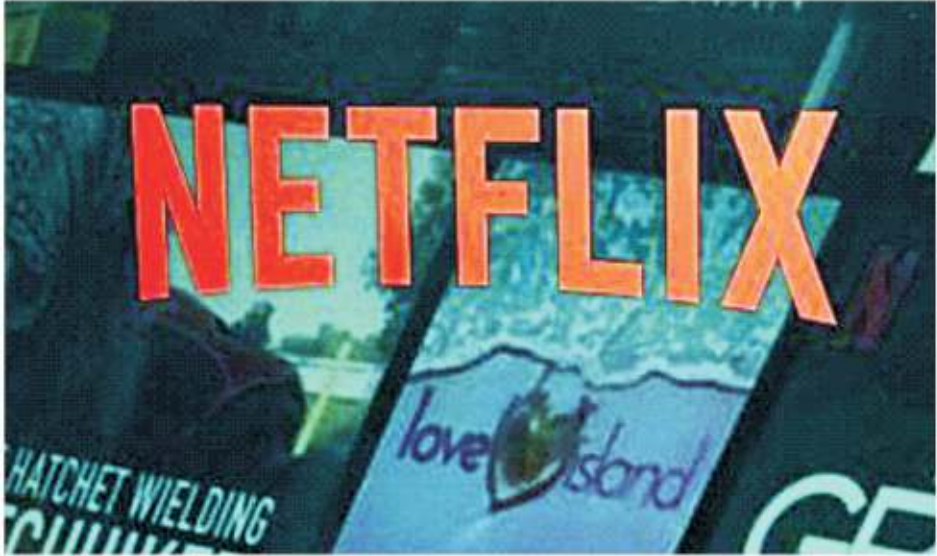
The Netflix logo - Copyright © africanews AP Photo

etflix said Wednesday it plans to expand its series centered on a Cape Town teenager who operations in Africa, building on the success of shows and series like the South African series "Blood and Water.