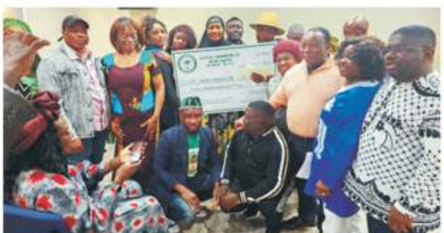
Members of the SLPP Washington Metro Chapter posed with the cheque