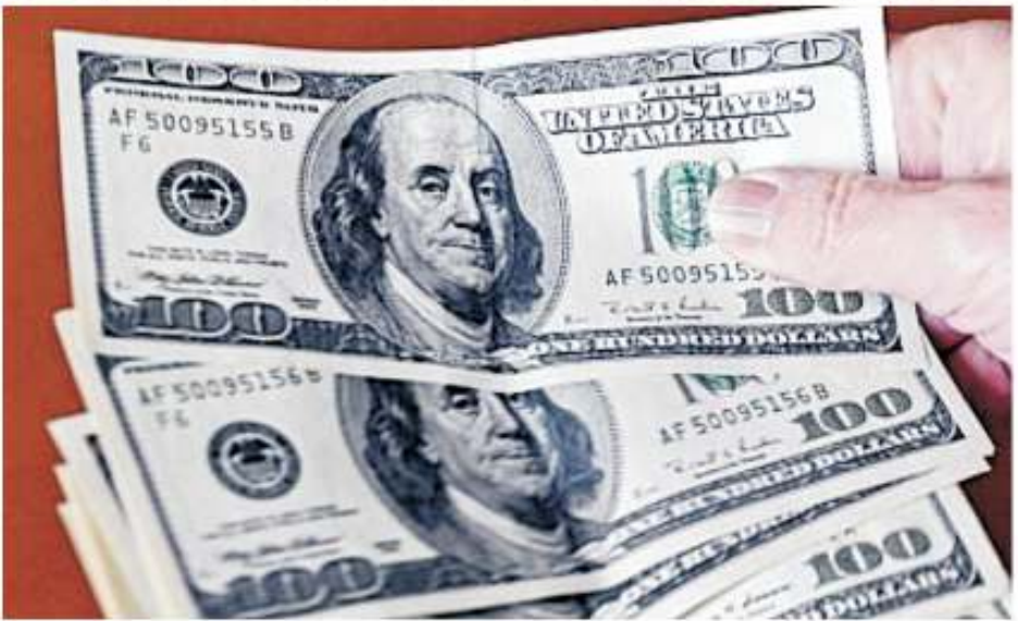
US dollar notes are photographed in Buenos Aires, on June 23, 2022.

Wednesday following the release of data that CPI. rose less than anticipated in March.