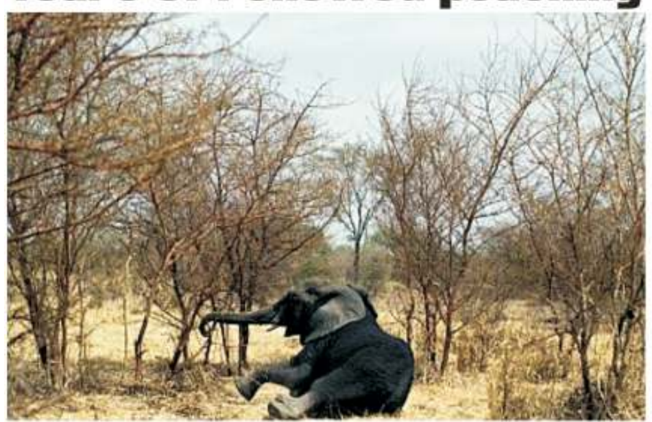
An elephant at Zakouma National Park on February 23, 2014

t least five elephants were killed last week in southern Chad by poachers who took their tusks, according to the authorities and an NGO which is alarmed Tuesday by a "sudden resumption" of these acts.