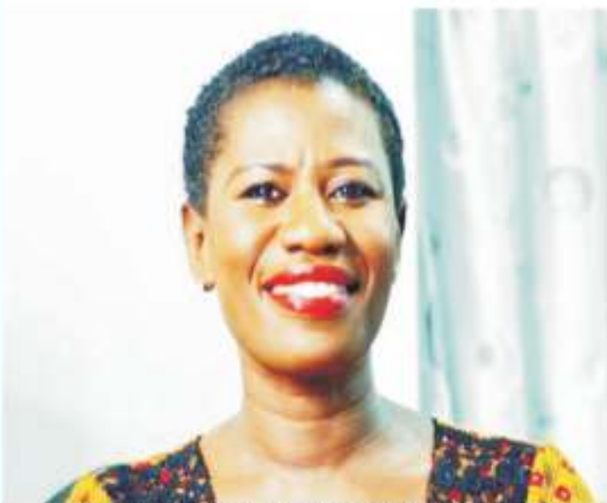
Smiling mayor Aki-Sawyer is confident of getting a second bite