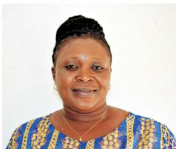
Chairperson, Parliamentary Committee on Gender and Children, Hon. Katherine Tarawally

In the area of protecting the rights of children who come in conflict with the law, the revised Child Rights Bill will help to improve the juvenile justice system in the country, as it makes provision for a diversion of certain cases to the juvenile court for the trial of child offenders.