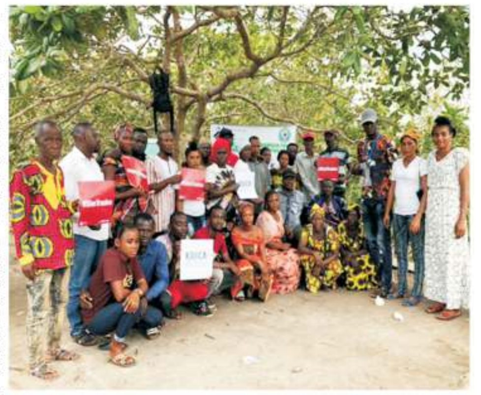
Participants at the training

and cashew orchards awhole. cashew products; processing and into good private sector operators, value addition to cashew and -its