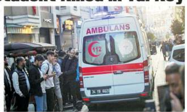
An ambulance on the Istiklal pedestrian avenue in Istanbul, 13 November 2022