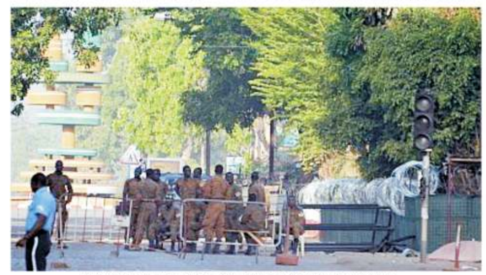
Military personnel stand in front of the country's defence force headquarters ...

A group of civil society organisations in Burkina Faso have expressed concern over cases of "abduction" and "forced recruitment" of citizens as army auxiliaries in the fight against jihadism, and denounced the "recurrent and systematic denial of freedom of opinion".