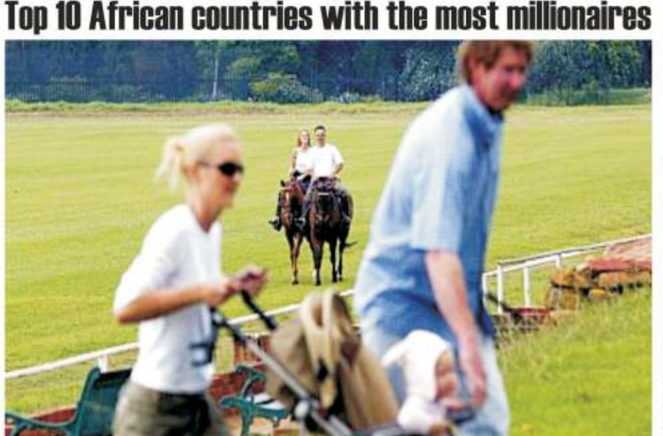
Polo players walk their horses during training at Inanda Country Club in Johannesburg, ... -

According to other civil society organisations, on Saturday, two of their representatives were also arrested and registered as VDPs after criticising the management of the transition at a press conference. Since 2015, Burkina has been caught in a spiral of violence perpetrated by Jihadist groups linked to the Islamic State and al-Qaeda, which has left a total of 10,000 civilians and soldiers dead, according to NGOs, and some two million displaced.