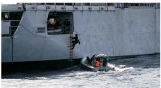
Photo Credit: Nigerian Navy Special Forces board a ship in the ... - Copyright © africanews Sunday Alamba/Copyright 2019 The AP

A Danish tanker flying the Liberian flag was attacked by pirates off Congo-Brazzaville in the Gulf of Guinea and contact was lost for three days with the crew of 16 sailors, its owner announced on Tuesday.