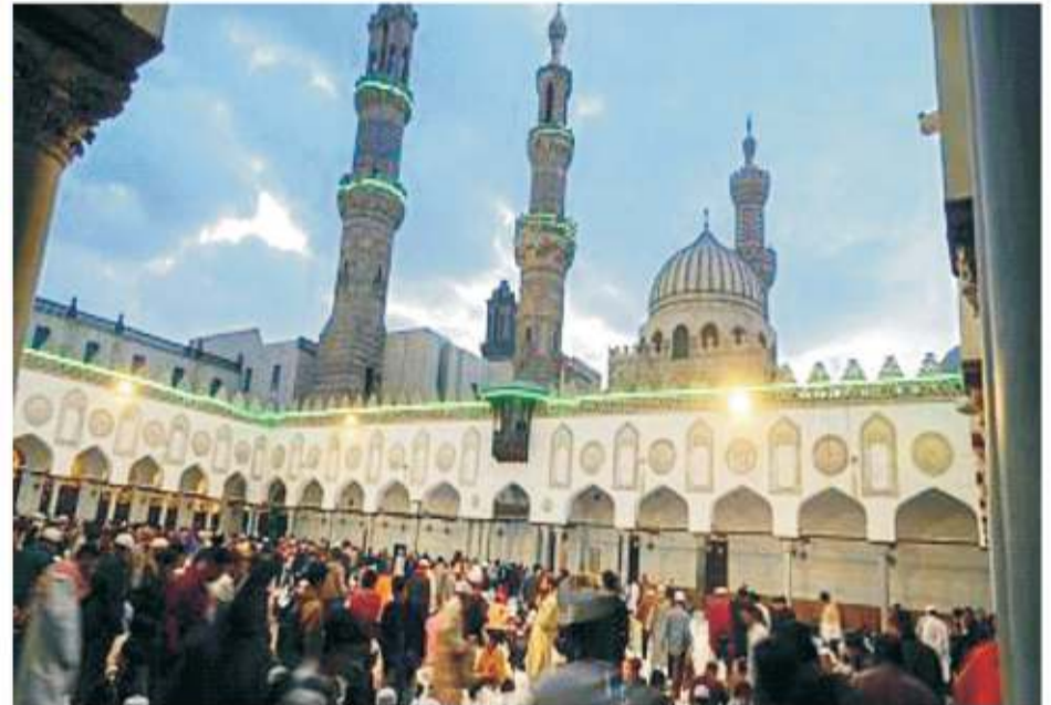
Muslims prepare to break fast during the Muslims holy fasting month of Ramadan...

In Egypt, Ramadan is synonymous with giving to the poorest. This year, with the economic crisis, prices have soared, donors have become scarcer and soup kitchens have had to seriously cut back.