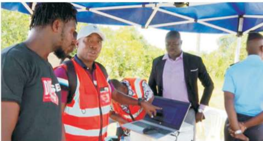
Ivorian police officers look at the list of offences against motorists at a police checkpoint near Grand Bassam

A new penalty system has been introduced in Ivory Coast to boost road safety.