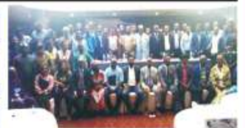
Stake holders in photo opps during the launch

IMC launches election coverage reporting, print media regulations