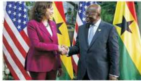
US Vice President Kamala Harris and Ghanaian President Nana Akufo-Addo in...

Other programs are intended to reduce child labor, improve weather forecasting, support local musicians and defend against disease outbreaks.