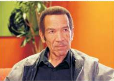
Use-up former Botswana president Ian Khama on Mar. 22, 2023.

Botswana's former president could be a candidate to watch out for in the nation's upcoming general elections. Ian Khama who is exiled stands for presidency of his party next month.