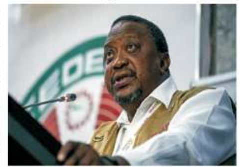
Kenya's former president Uhuru Kenyatta speaks at a joint press... - Copyright © africanews Ben Curtis/Copyright 2023 The AP. All rights reserved

Azimio is requesting that the president include them in the decision-making for IEBC officials as well as the intriguing launch of IEBC servers.