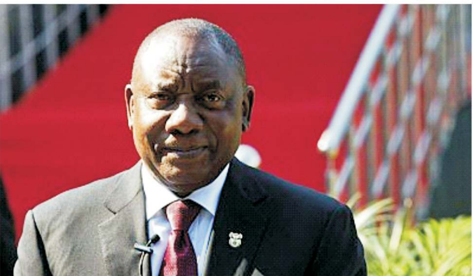
South African President Cyril Ramaphosa arrives for his swearing-in ceremony at Loftus... South Africa's economy is at risk of stagnating this