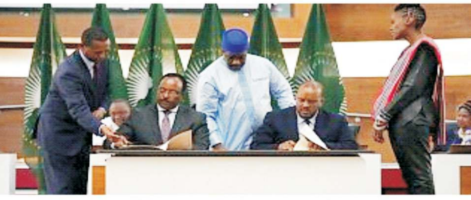
Lead negotiator for Ethiopia's government, Redwan Hussein, left, and lead Tigray....

he Ethiopian government on Thursday appointed a several months of popular protest. Tigrayan rebel figure to head the interim government of the northern region, a major step in the implementation of a peace deal signed by the two sides after two years of civil war.