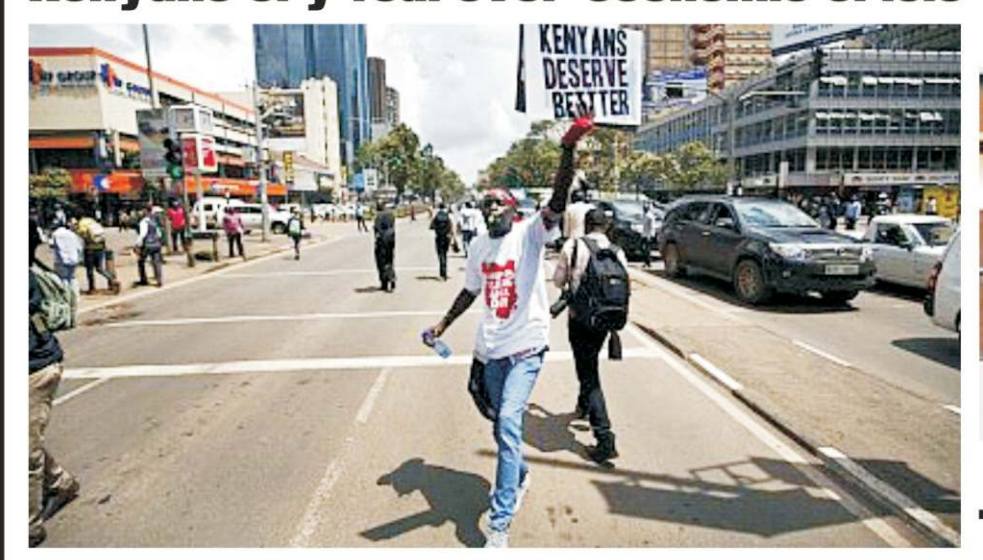
A protester runs during an anti-corruption demonstration in downtown Nairobi, Kenya...

launched when his future slipped away and a disorder". Kenyan bank auctioned off his car for non- An ambitious young leader, William Ruto had payment of a $9,900 loan.